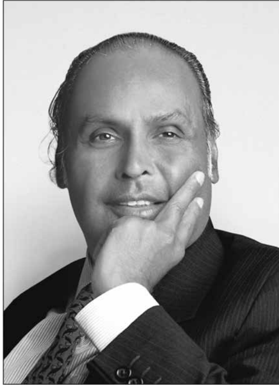
Padma Vibhushan Shri Dhirubhai H. Ambani (28th December, 1932 - 6th July, 2002) Reliance Group - Founder and Visionary