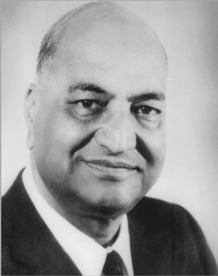
LALA LAKSHMIPAT SINGHANIA 1910 - 1976