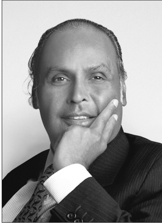
Padma Vibhushan Shri Dhirubhai H. Ambani (28 th December, 1932 - 6 th July, 2002) Reliance Group - Founder and Visionary