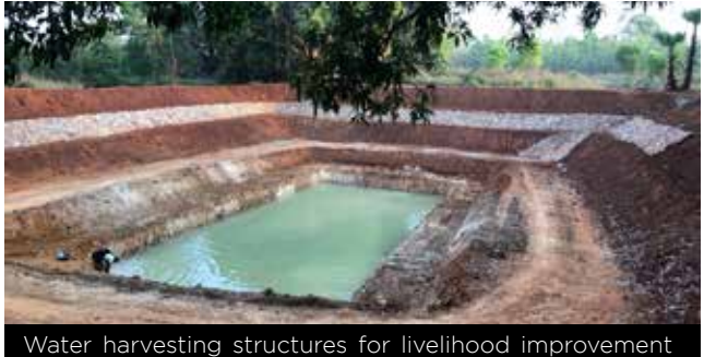
by double cropping & cash crops, Ghodabara, Odisha