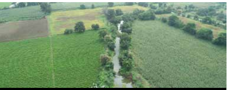
Jal Sanrakshan II, aerial view of water harvesting structure filled with water to support sustainable farming, Aurangabad, Maharashtra