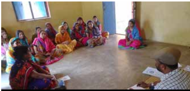
Beekeeping training program for women self help group for sustainable livelihood, Cuttack, Odisha