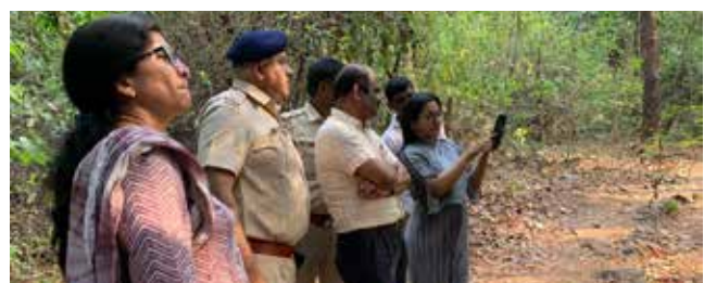
India's first nature trail mobile app for information, communication & education on biodiversity, Karnala Bird Sanctuary, Maharashtra