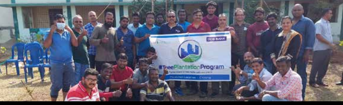
Urban plantation of indigenous trees with citizen volunteers, Chennai