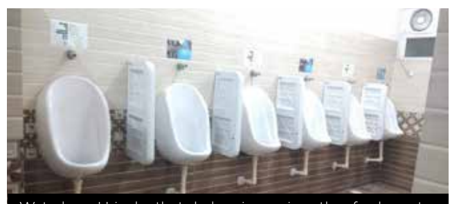
Waterless Urinals that helps in saving the fresh water and which helps in controlling the odor in the restroom, Vishakapatanam, Andhra Pradesh