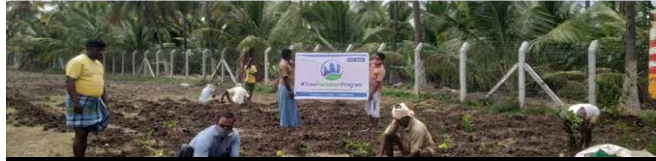
Citizen volunteers participating in tree plantation to create mini urban forest, Coimbatore, Tamil Nadu