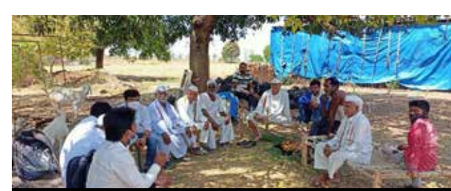
Jal Sanrakshan, village development committee meeting for water usage and farming techniques, Aurangabad, Maharashtra