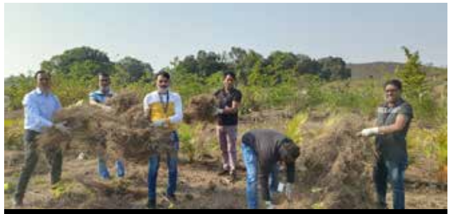
Habitat restoration & tree plantation by DCB Social volunteers, Ambivali Biodiversity Park, Maharashtra