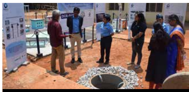
Water conservation through rainwater recharge wells, Bengaluru, Karnataka