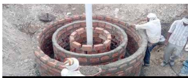
Jal Sanrakshan, recharge shaft for groundwater development for sustainable farming at Nidhona village, Aurangabad, Maharashtra