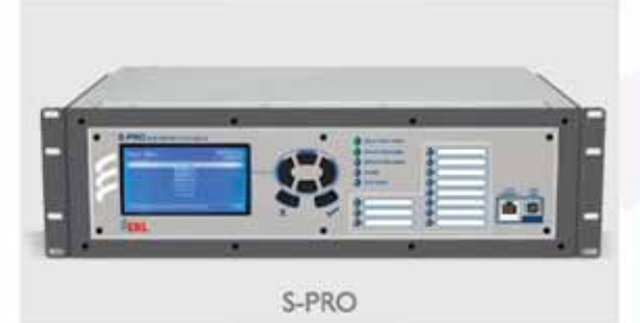
Sub-harmonic Protection Relay