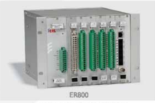
Feeder Remote Terminal Unit