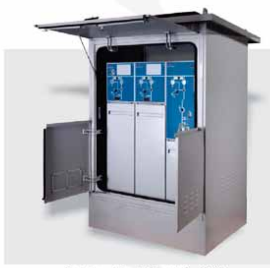
Outdoor Ring Main Unit - KKV Type iGIS