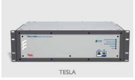
Power System Recorder with CDR, PMU and IEC 61850 Station Bus Protocol