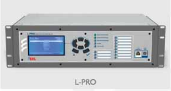
Transmission Line Protection Relay with IEC 61850 Station Bus Protocol