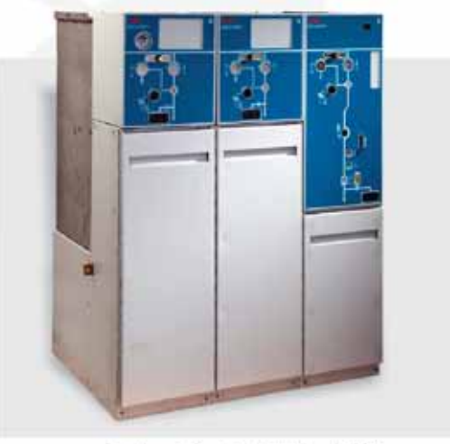
Indoor Ring Main Unit -KKV Type iGIS