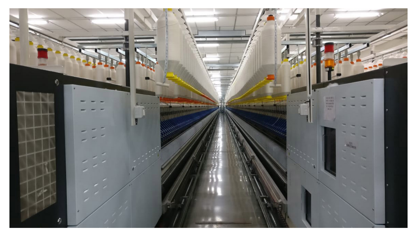
Ring Frame section