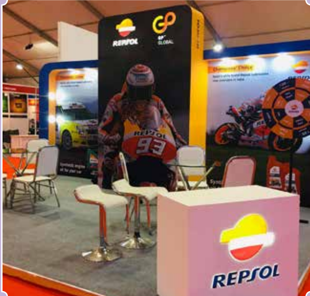
Repsol Stall at Auto Car Expo, Mumbai