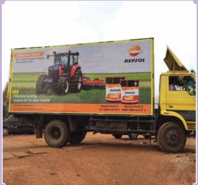
Repsol Truck Branding - Karnataka