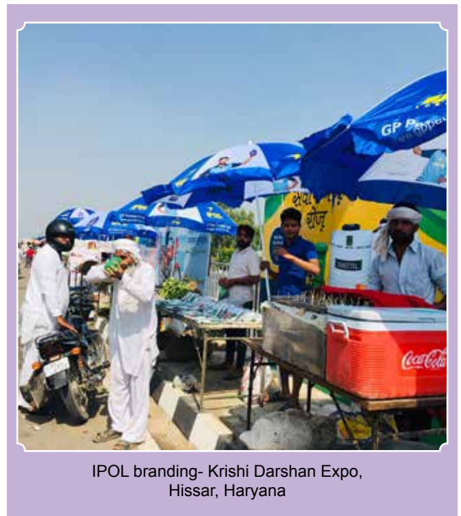
IPOL branding- Krishi Darshan Expo, Hissar, Haryana