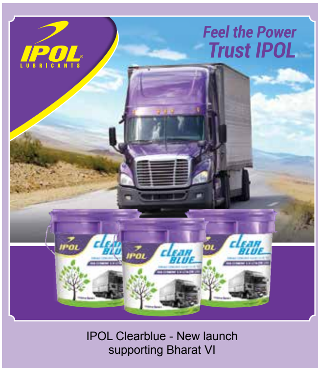
IPOL Clearblue - New launch supporting Bharat VI