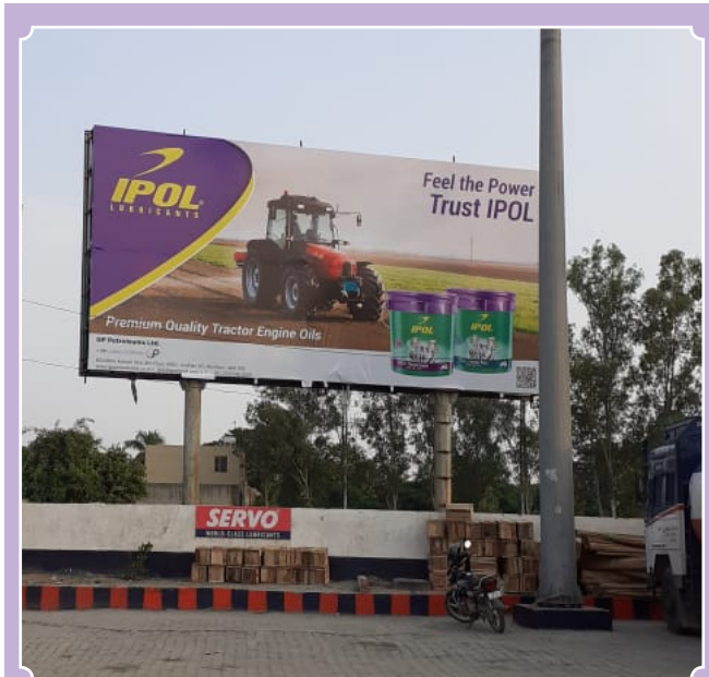
IPOL hoarding at IOC Petrol pump