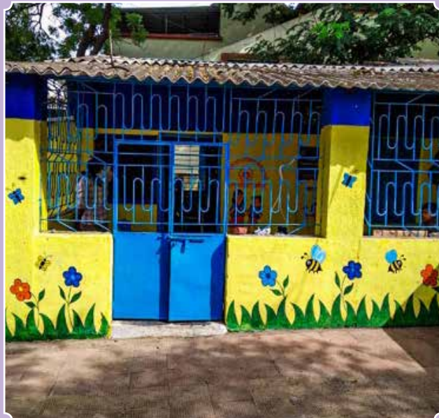
GPPL renovates the Anganwadi - Kids Preschool at Vasai