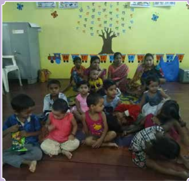
School Kids at the newly renovated Anganwadi