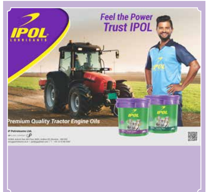
Tractor Kamaaye Zyada, Yeh hain IPOL ka Vaada !