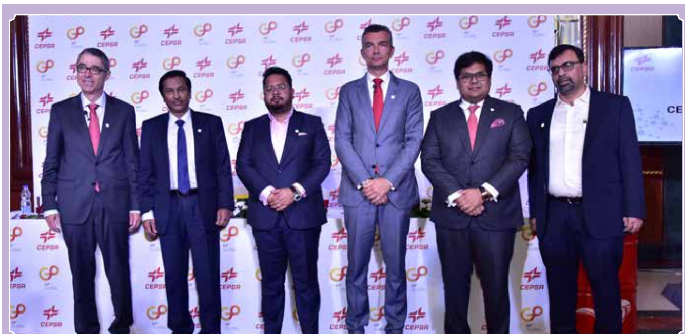
CEPSA Spain approves GPPL plant for blending Marine Lubricants.