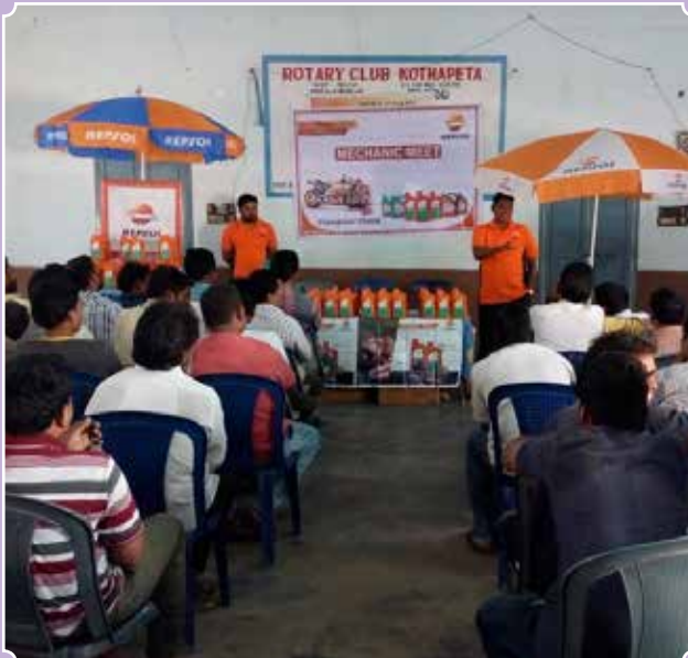
Repsol Mechanic Meet in progress