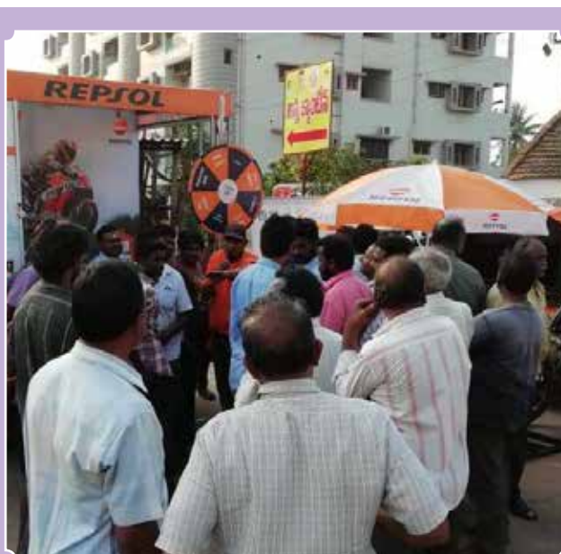
Road Show - Van Campaign activity in Andhra Pradesh