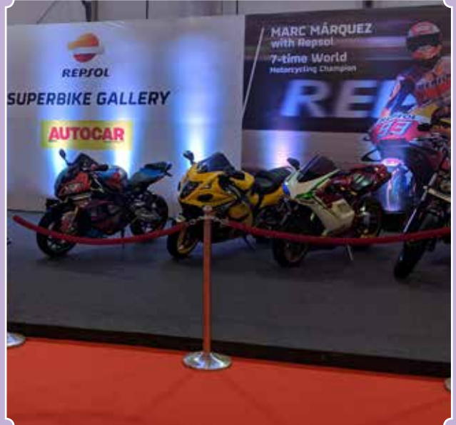
Repsol Super Bike Gallery at Auto Car Expo, Mumbai