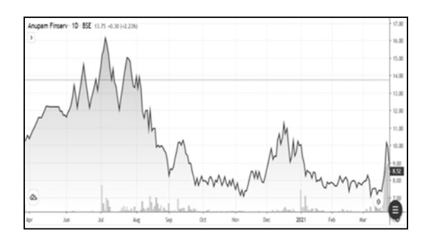
Anupam Finserv Ltd

7. No securities are suspended from trading.