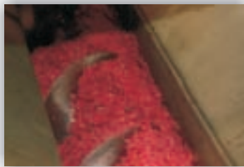
Seed Waste Conveyer