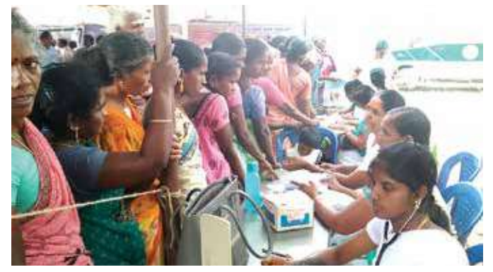
Medical Camp organised through Public Health Department