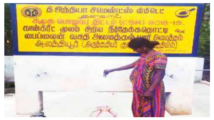
Providing drinking Water Facility to Villagers