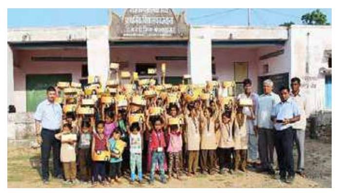
Distribution of Sports items to students