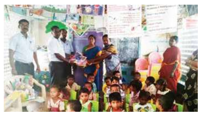
Providing Furniture to Balwadi Centres