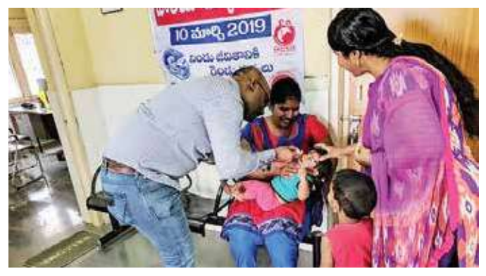
Pulse Polio Camp