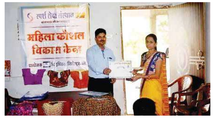
Certificate course on Tailoring