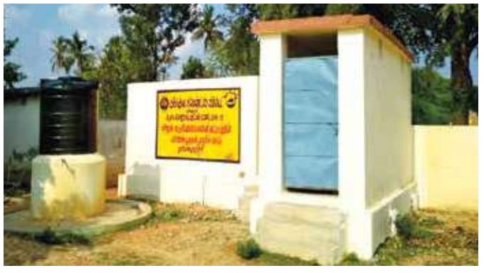
Construction of restroom at Government School