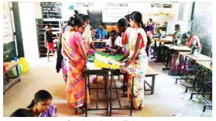
Coaching class on Tailoring