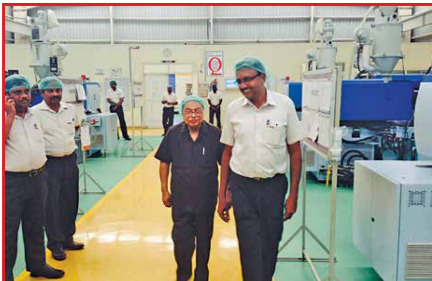
Expansion of Unit 2 and Directors visit at Puducherry