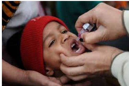
Eradication of Polio

BHARAT IMMUNOLOGICALS AND BIOLOGICALS CORPORATION LIMITED