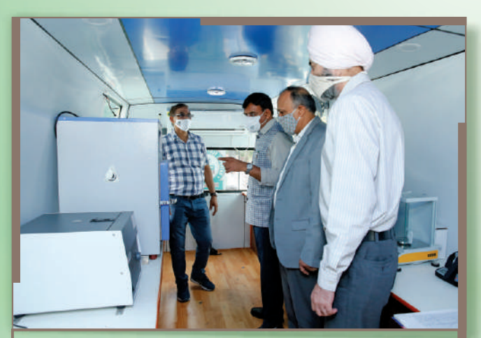
Hon'ble Minister of Chemicals & Fertilizers inspecting the equipments inside the new Mobile Soil Testing labs. C&MD, Director (Tech) are also present on the occasion