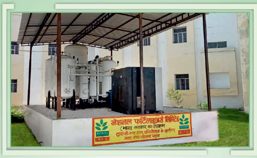
The company installed & commissioned 04 nos. Medical Oxygen Generator Plants at Bhopal, Lucknow, Gorakhpur & Indore to strengthen the Covid Care facilities