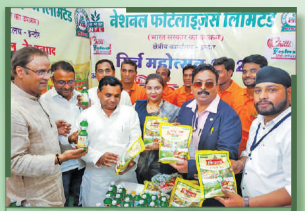
Area Office Indore participated in the event Mirch Mahotsav for farmers in Distt. Khargone (Madhya Pradesh)