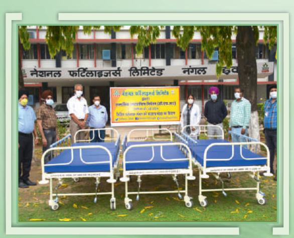
The company provided 05 nos. Fowler Beds to Civil Hospital Nangal under CSR