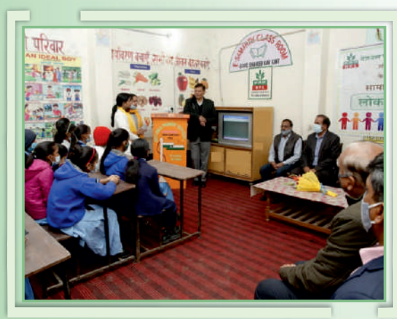
NFL installed E-Samarth (smart classes) in 25 Government schools of Panipat, Haryana