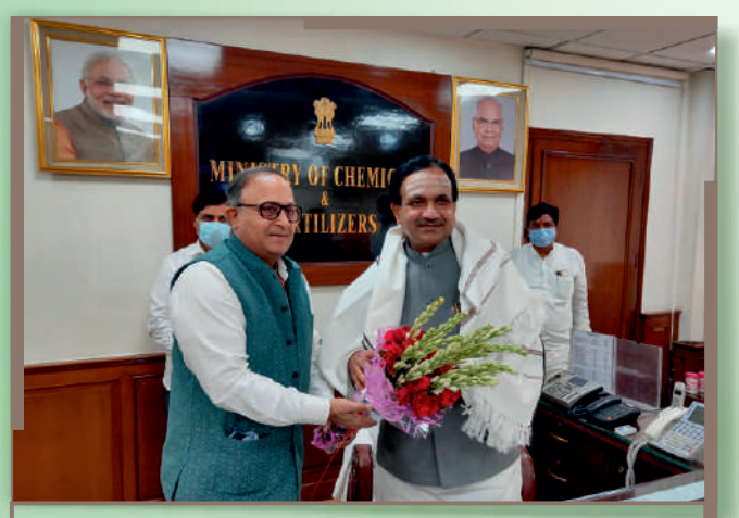
Shri V. N. Datt, C&MD, NFL greeting Shri Bhagwanth Khuba, Hon'ble Minister of State for Chemicals & Fertilizers and New & Renewable Energy upon taking charge of the ministry