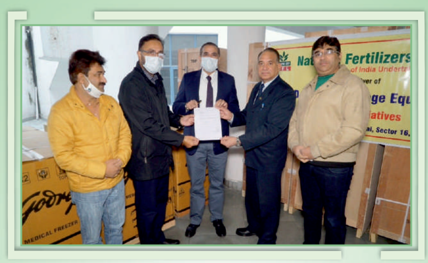
NFL Officials handing over Cold Chain Equipments in Chandigarh to aid Government's Covid-19 Vaccination programme