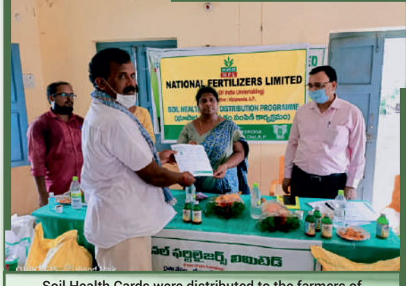
Soil Health Cards were distributed to the farmers of Kakaraparru Village, West Godavari Distt. (Andhra Pradesh) during a programme