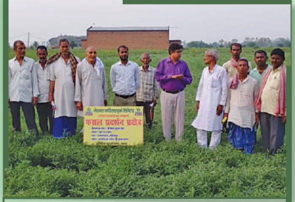
A view of Field day conducted at Village Mohanpur, Distt. Deoghar, (Jharkhand) explaining importance of Crop Rotation to the farmers