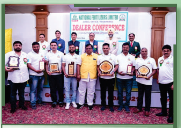
Dealers achieving excellent product sales were awarded at a Dealers' conference held in Goa