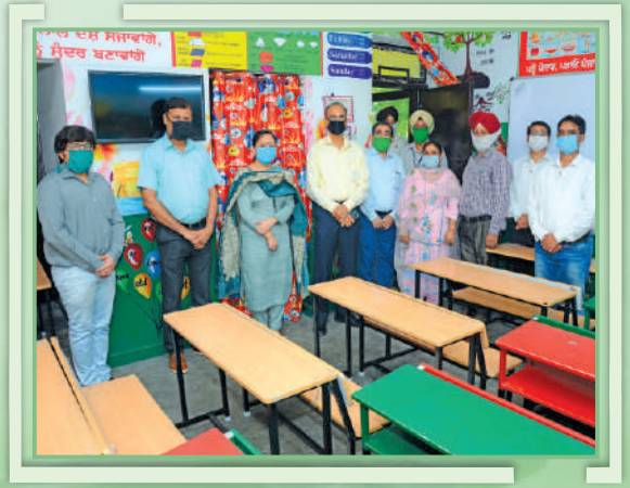
Senior NFL Officials during the distribution of Desks & Benches in Government Primary School, Bathinda