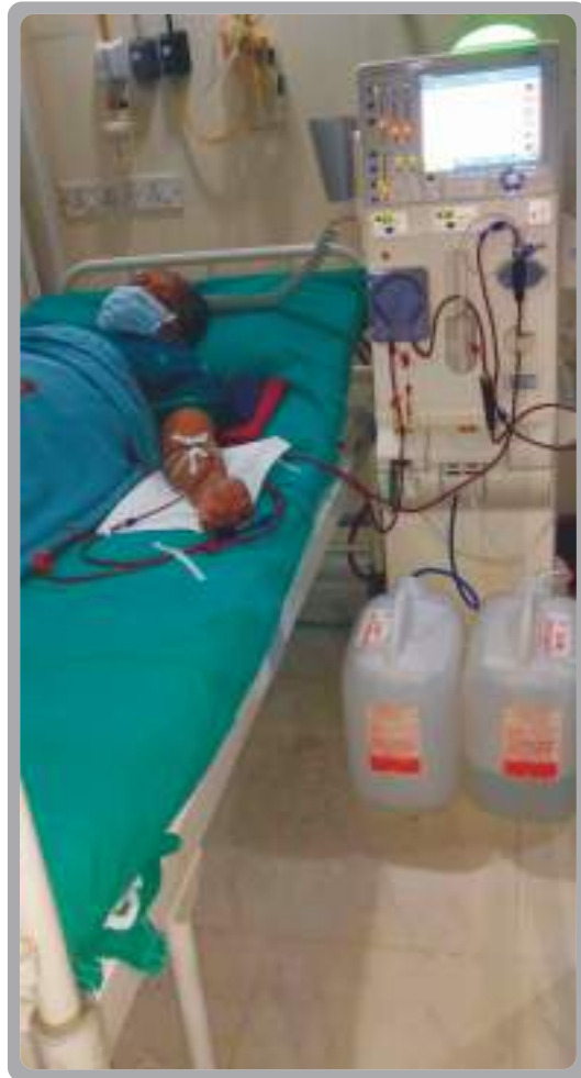
Beneficiary receiving dialysis from dialysis machine under CSR Programme