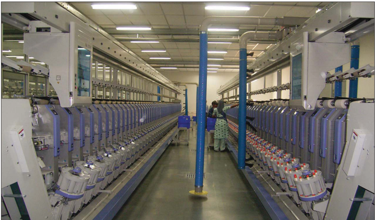
View of Spinning Plant, VTM Ludhiana