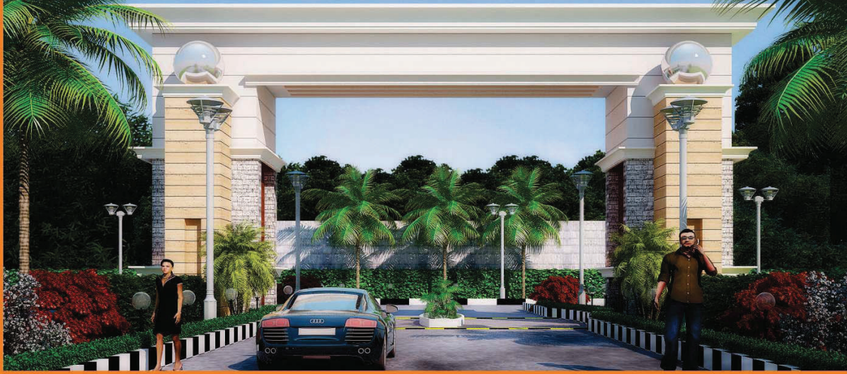
Proposed Gate Plaza of Vardhman Park, Ludhiana