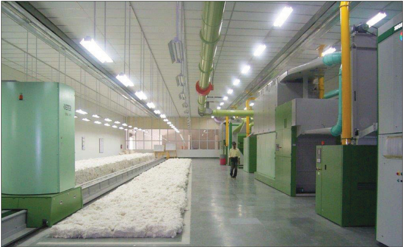
Rieter Blow Room, VPL Bathinda