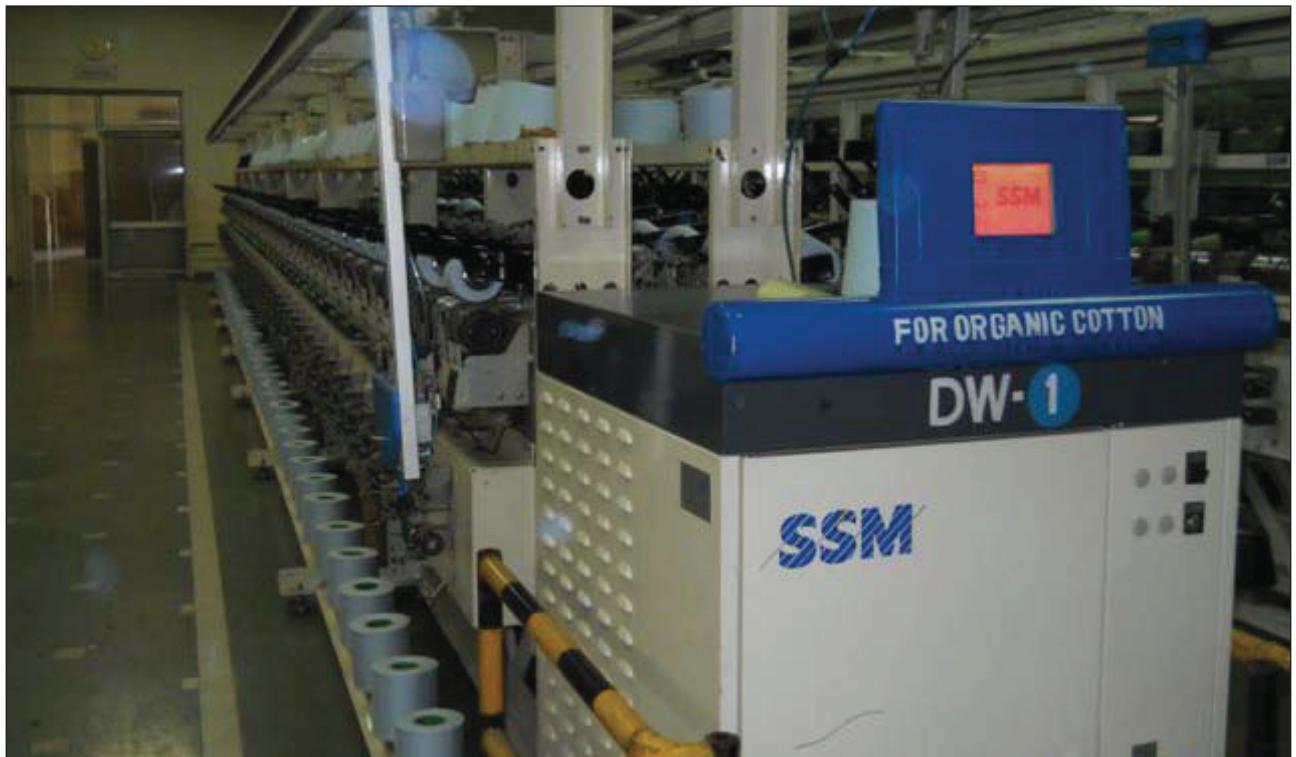
View of Dying Plant, VTM Ludhiana