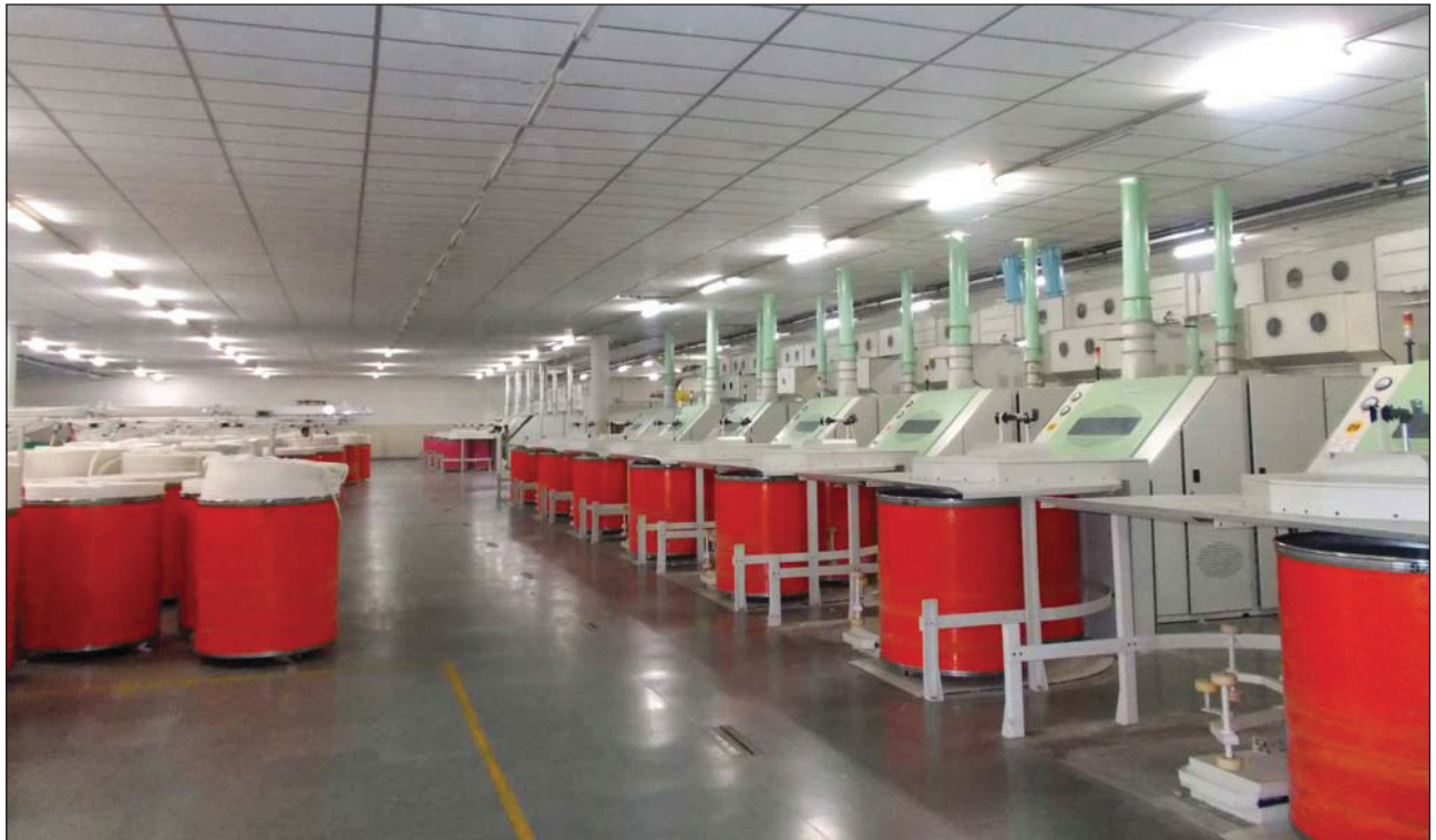
View of Spinning Plant, VPL Nalagarh