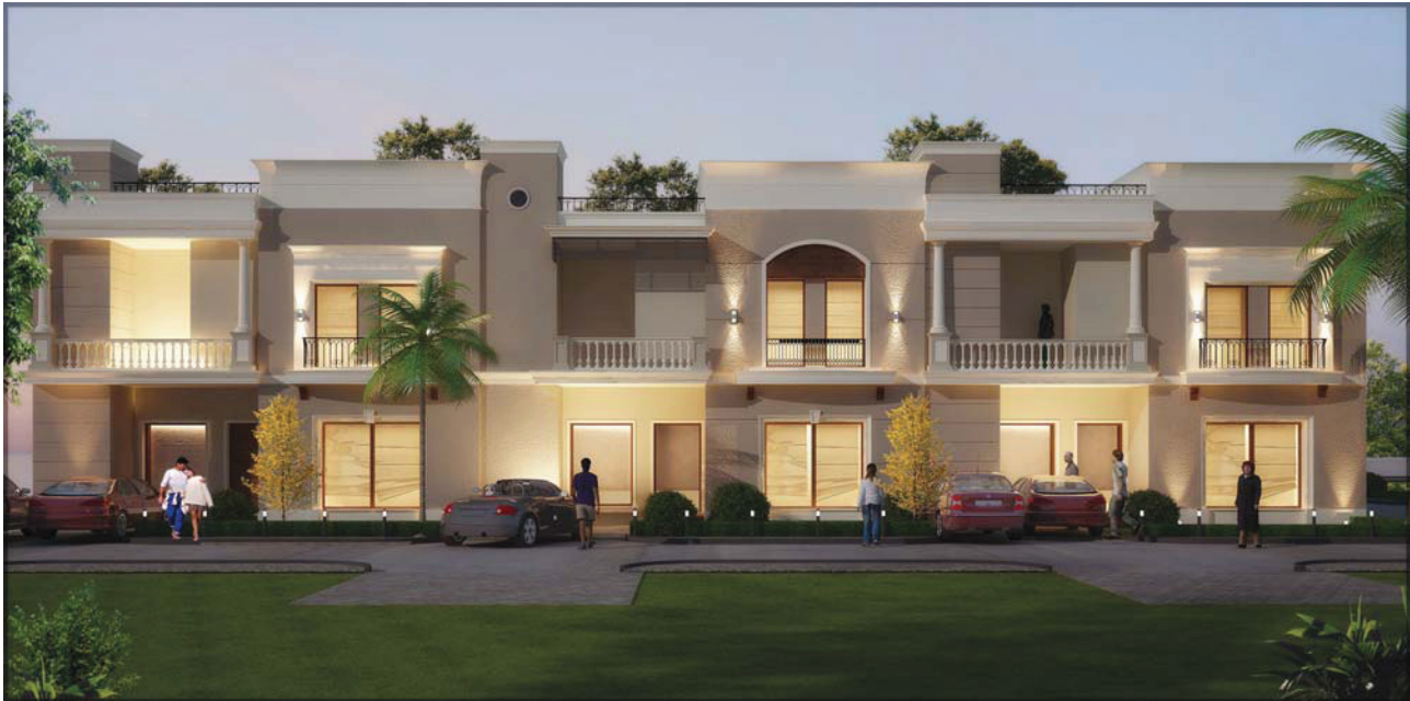
View of Proposed Residential Villa at Vardhman Park, Ludhiana