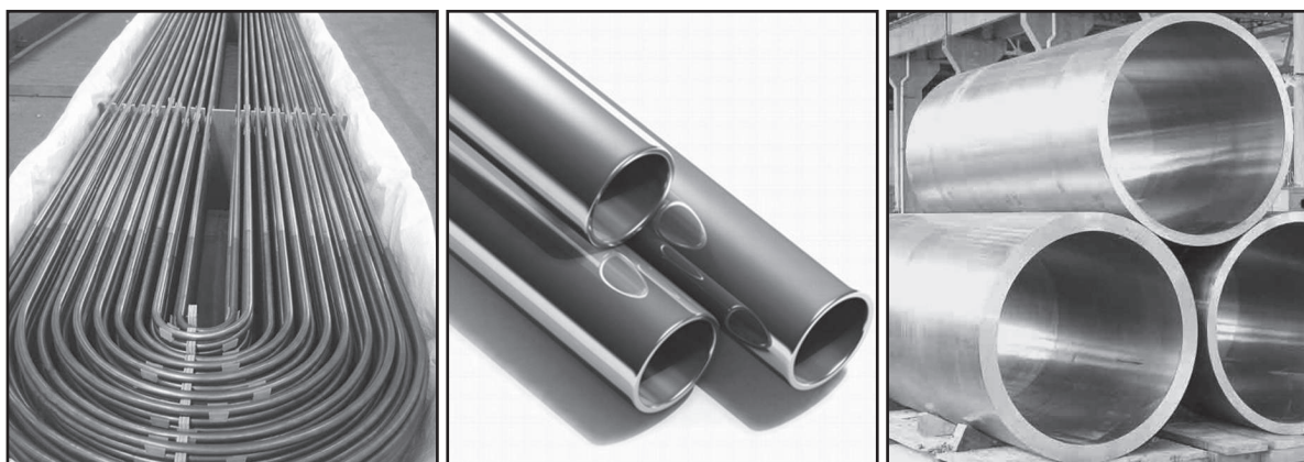
Stainless Steel Welded and Seamless Pipes & Tubes