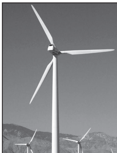
Wind Power Promoting Green Energy