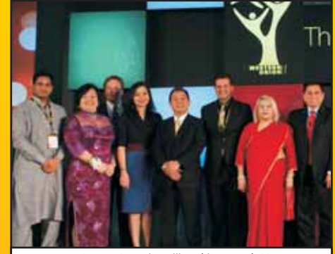
APAC Agent Summit, Beijing China, March 2011