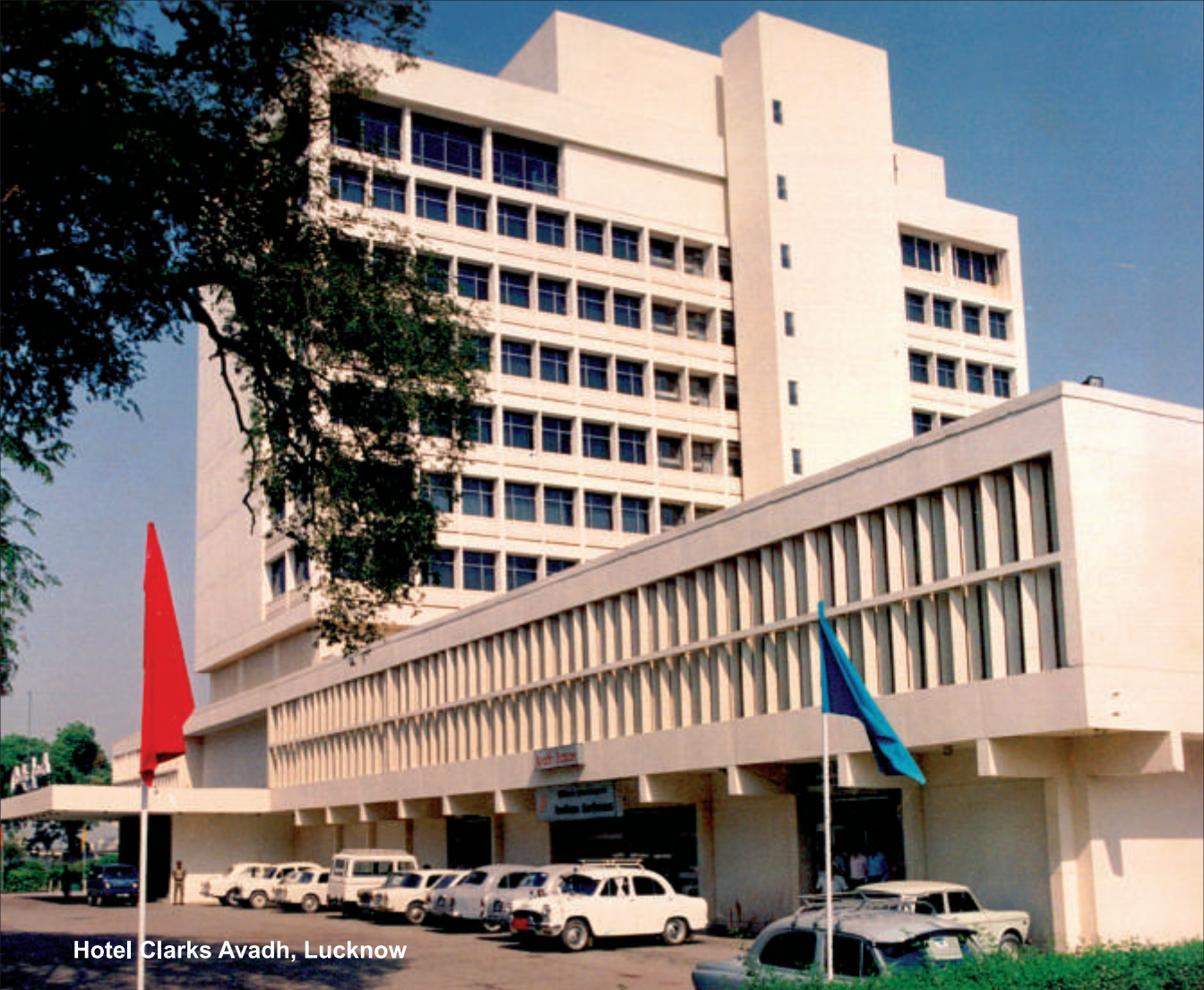
Hotel Clarks Avadh, Lucknow