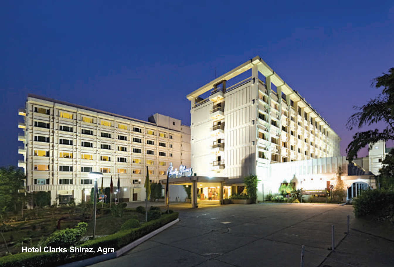
Hotel Clarks Shiraz, Agra