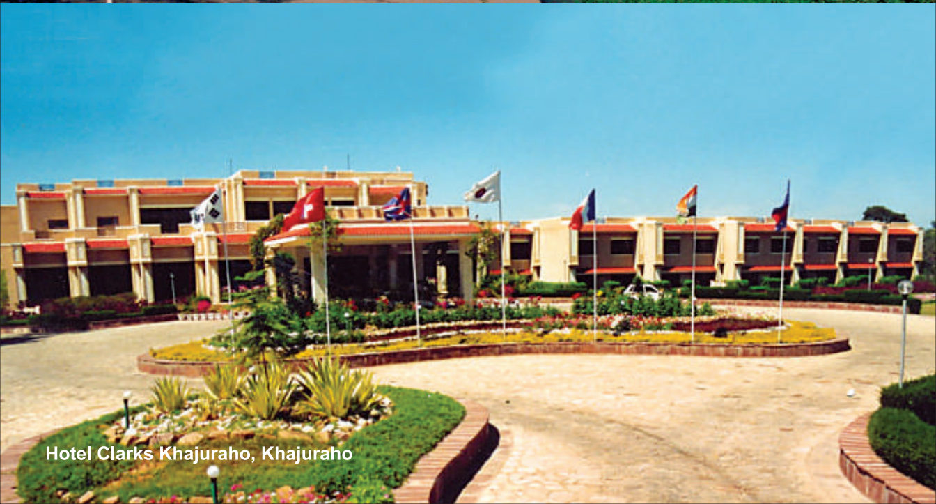
Hotel Clarks Khajuraho, Khajuraho