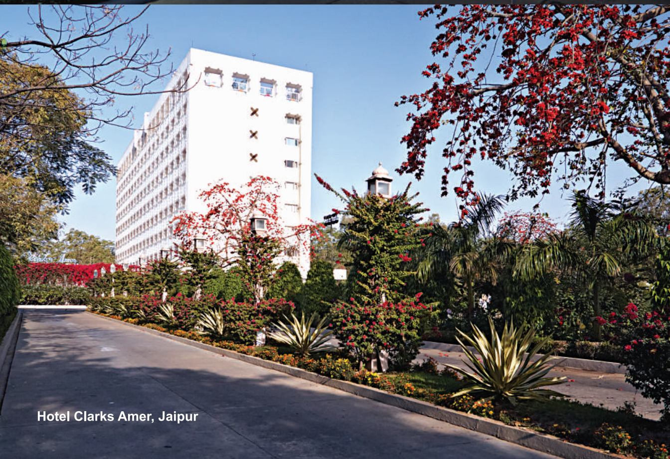
Hotel Clarks Amer, Jaipur