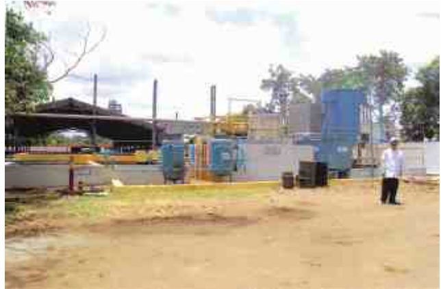
Effluent Treatment Plant