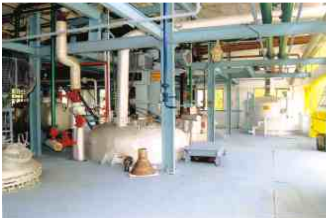
Resin Manufacturing Facility