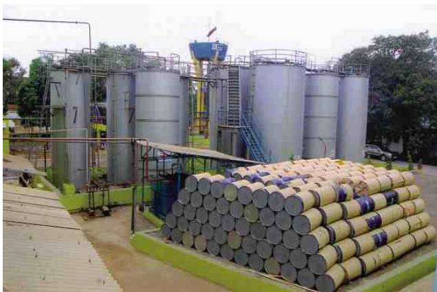
Raw Material Storage Facility