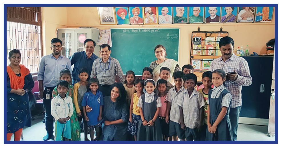
Nutrition Supplement Provision Programme to over 325 students of 5 tribal-rural schools in Patalganga