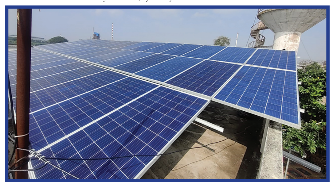
Installation of 25 KW solar panels at Grampanchayat office, Vadadla, Dahej