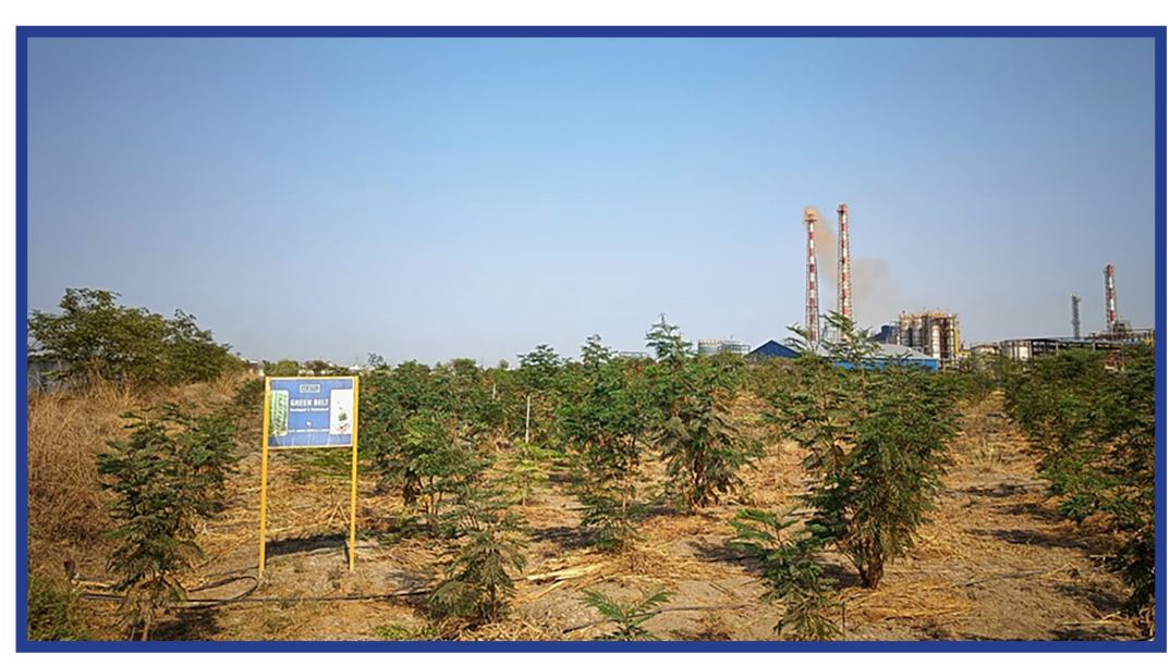
Green Belt Development near Dahej Plant whereby we planted over 3700 trees