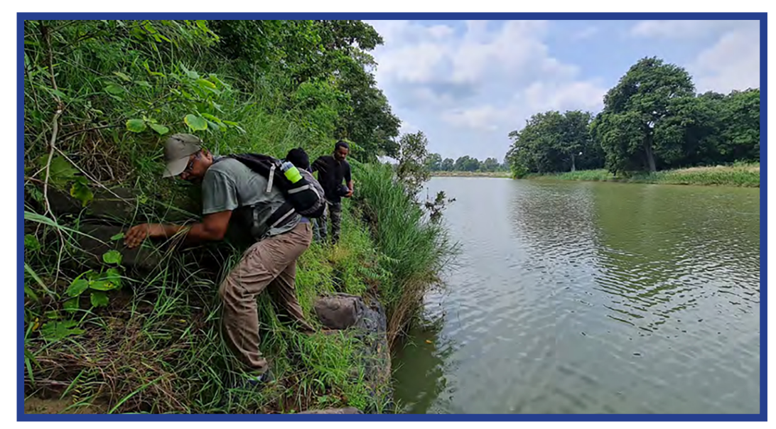
Surveys along the Denwa River, as part of the Otters Hydrology Project in Satpura Tiger Reserve, Madhya Pradesh, by Wildlife Conservation Trust.