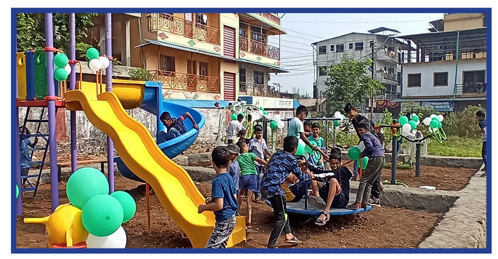
Construction of open gym at Patalganga to promote community health