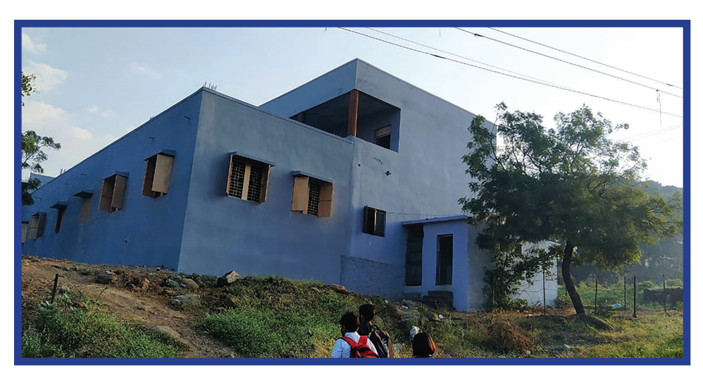
Construction of 3 classrooms for the Vocational Skill Training Centre, Kurkumbh