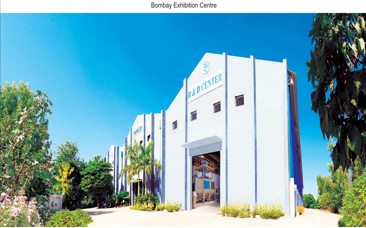
New Research & Development Facility At Vishnoli Complex, Gujarat