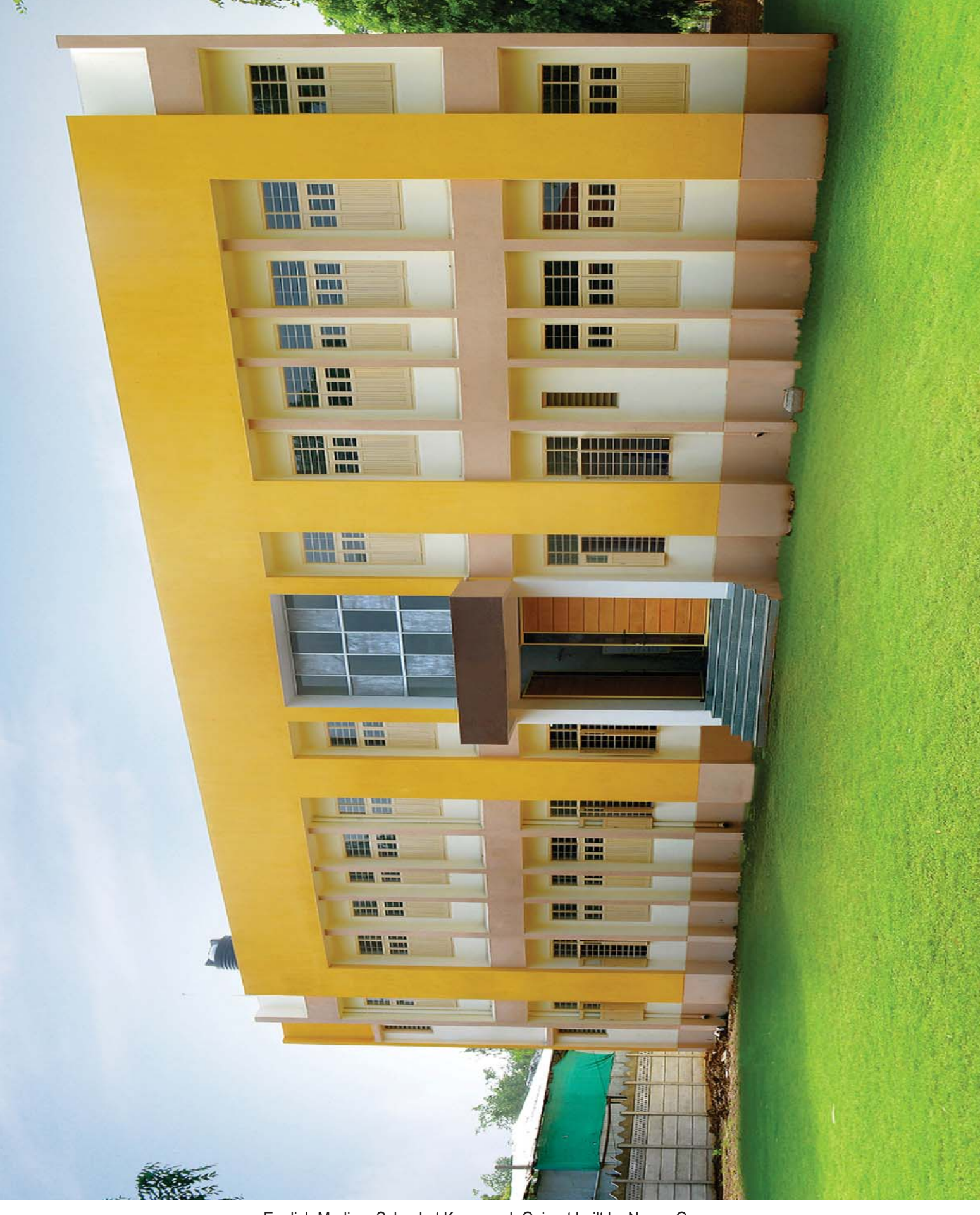
English Medium School at Karamsad, Gujarat built by Nesco Group