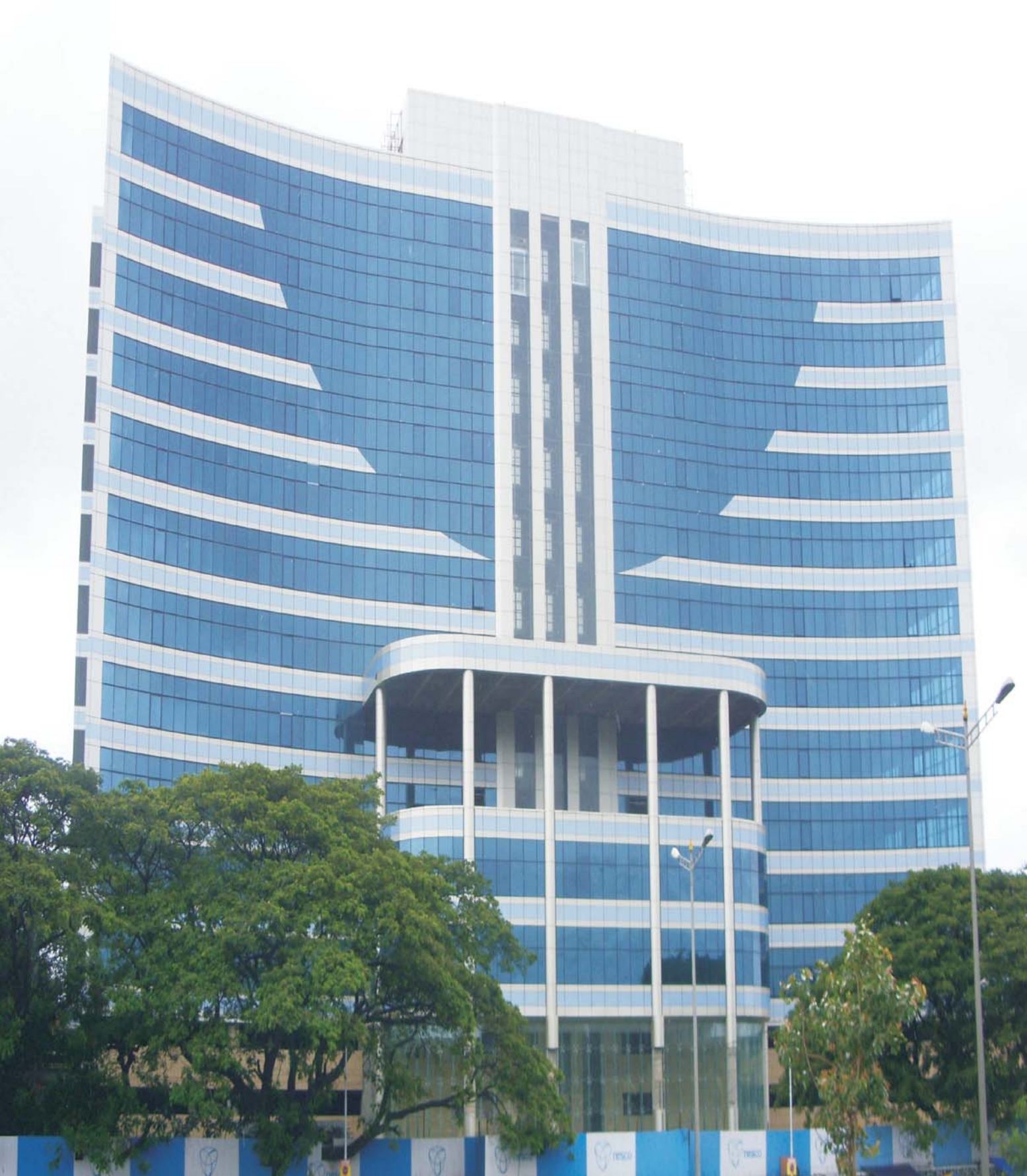
Nesco IT Park - Building no. 3