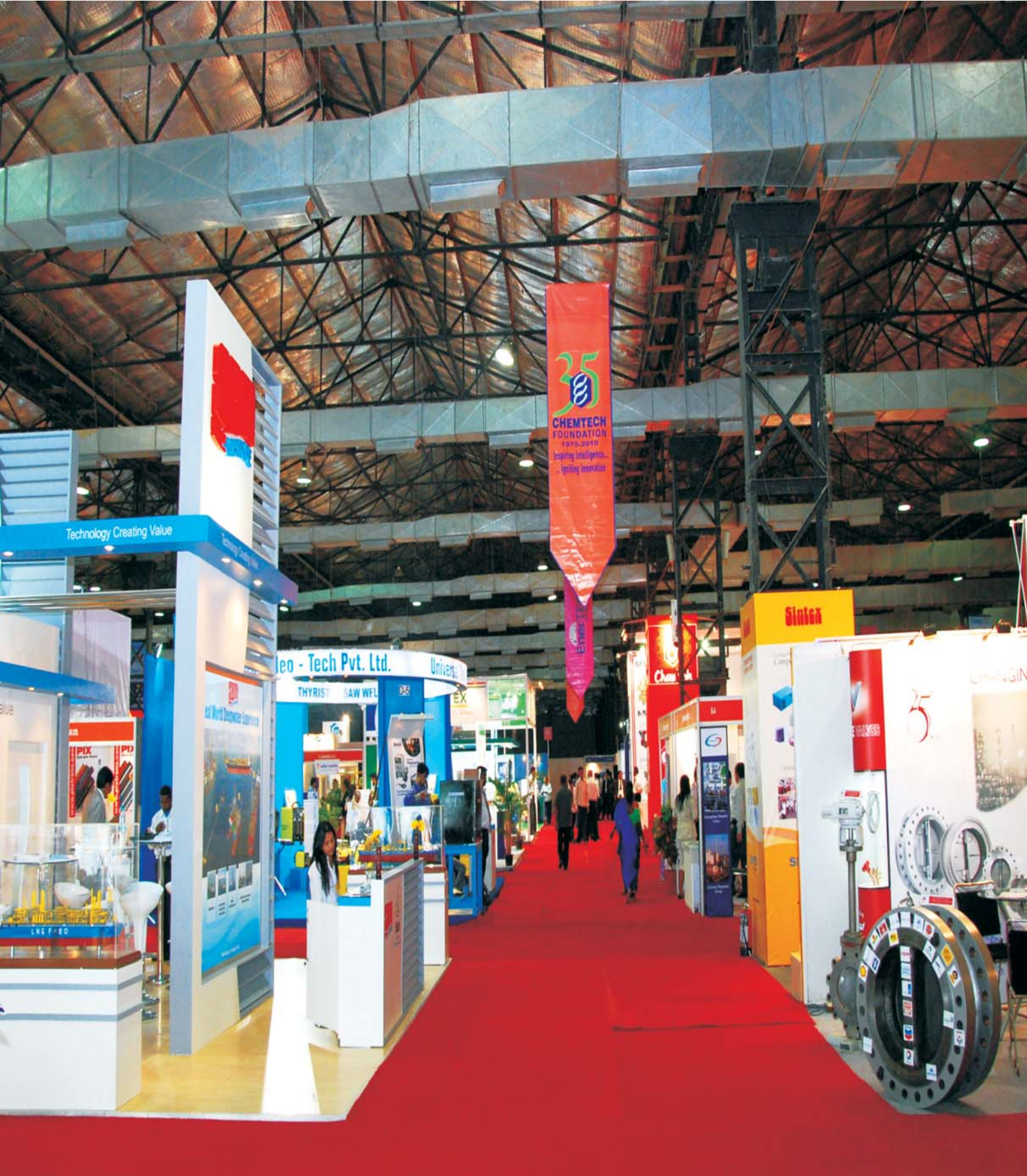
BOMBAY CONVENTION & EXHIBITION CENTRE