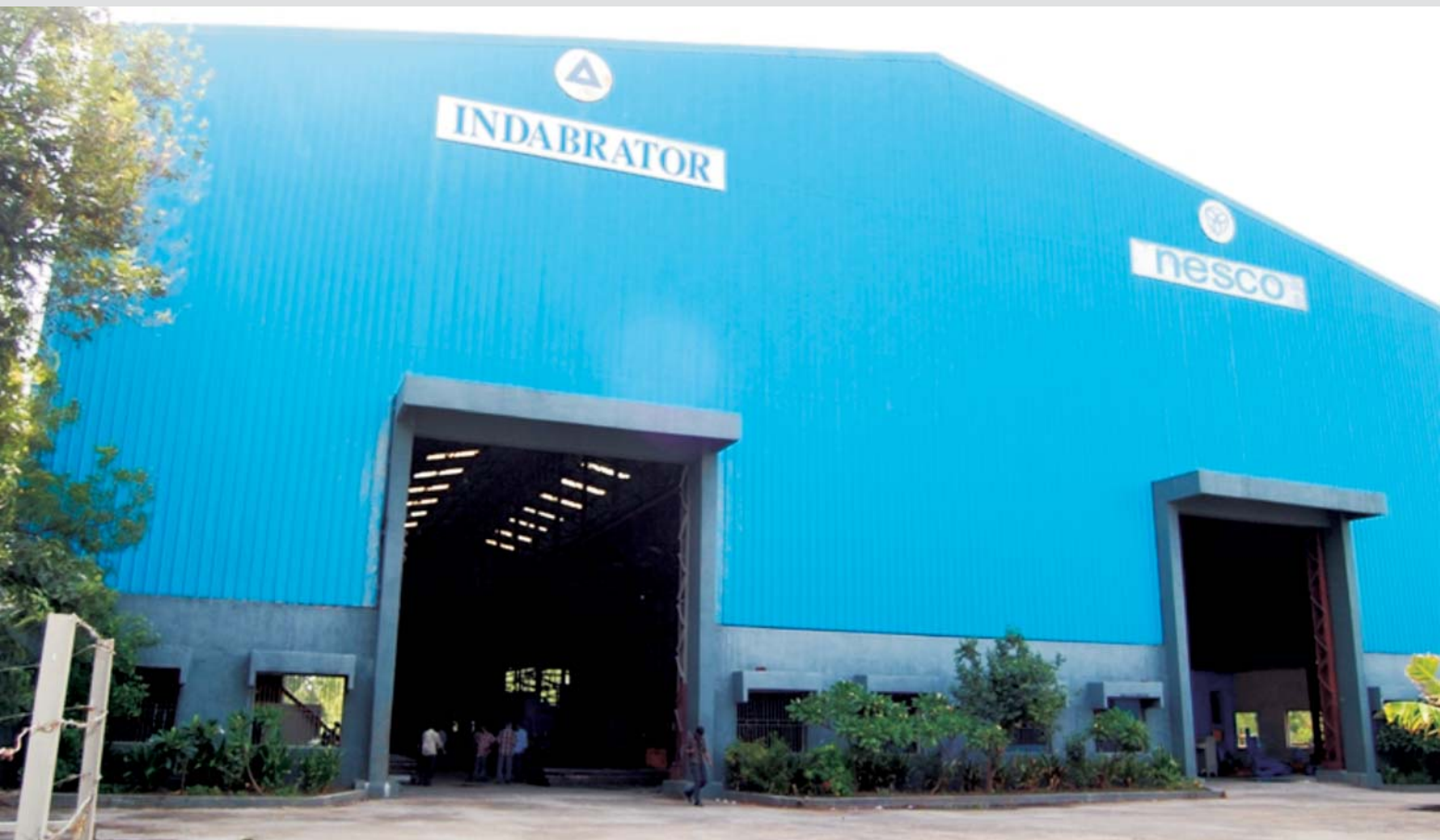
Plant No. 02 at Vishnoli for large size and special machines