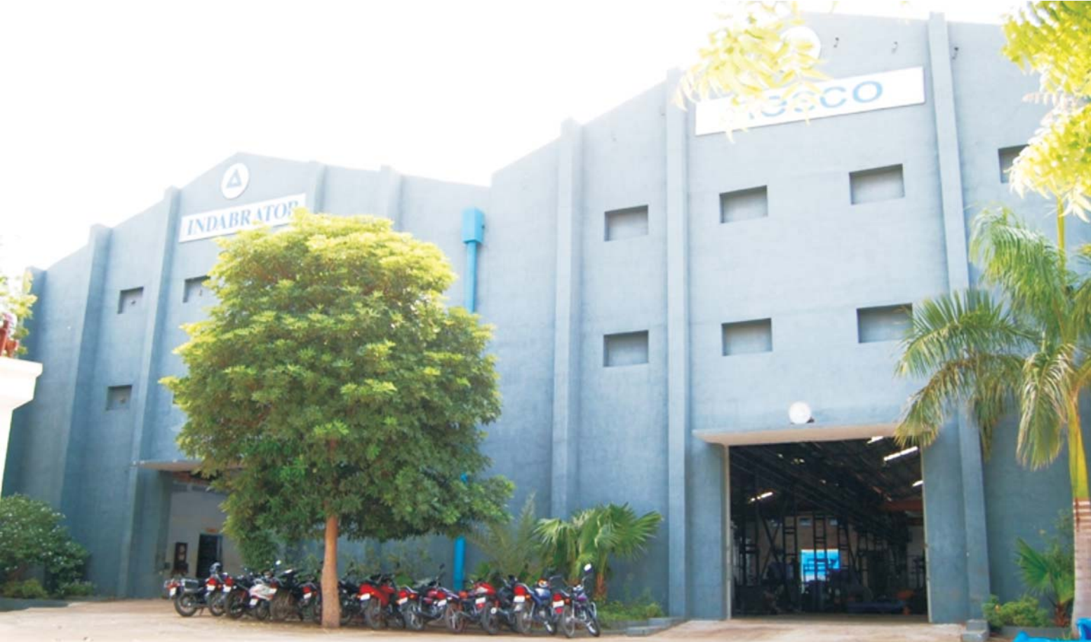
Plant No. 01 at Vishnoli