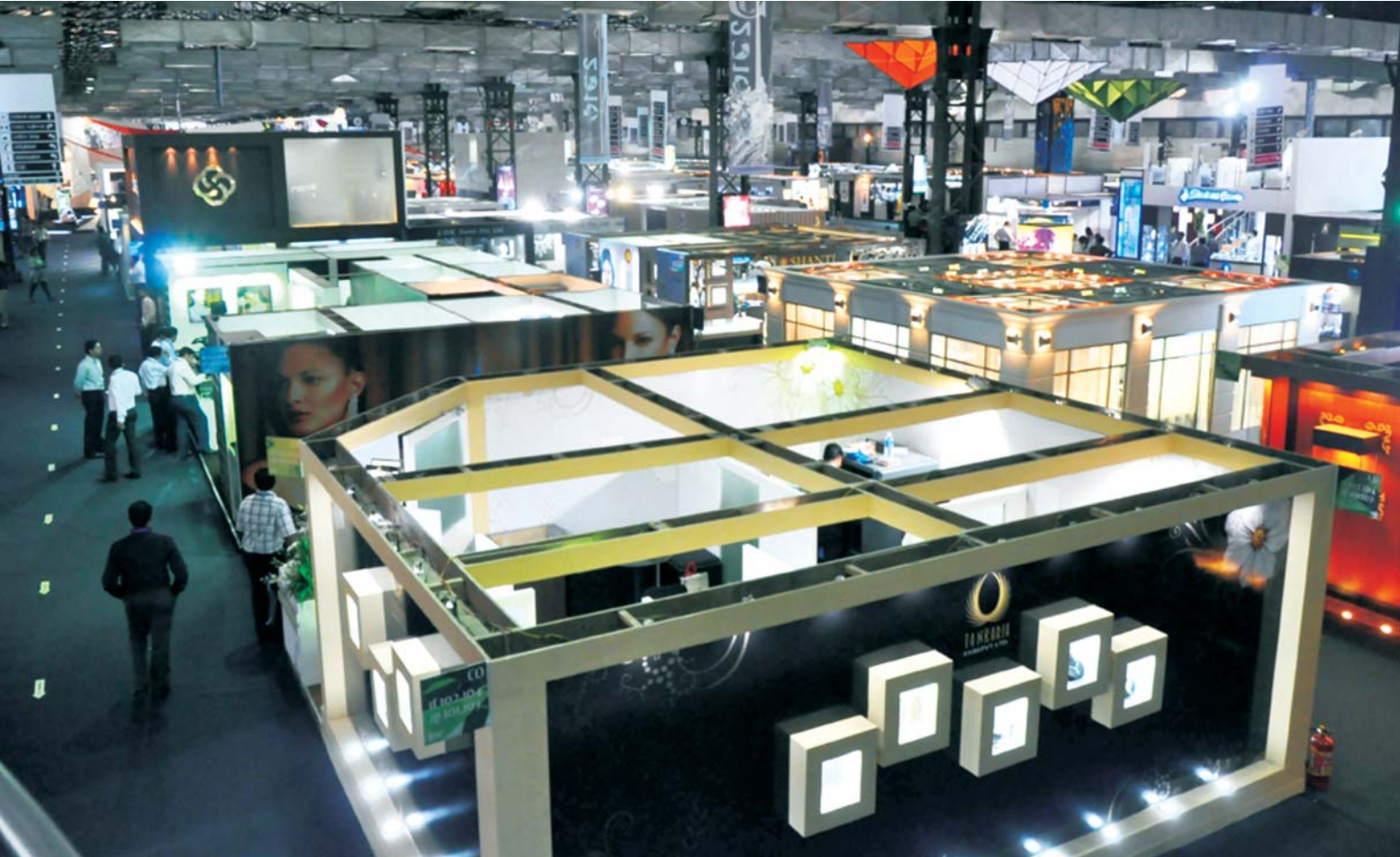
BOMBAY CONVENTION & EXHIBITION CENTRE