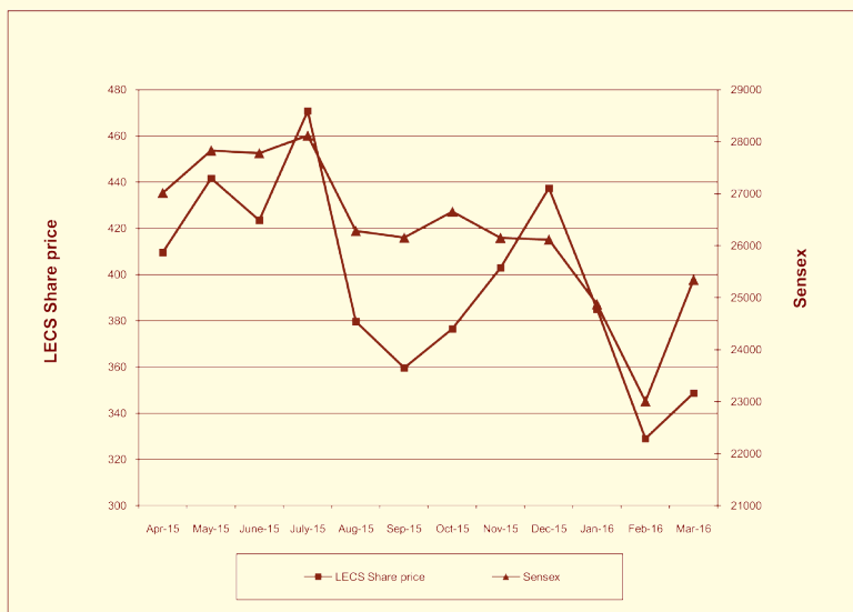
LECS Share price vs BSE Sensex

The equity shares of the Company are not suspended from trading in BSE Limited.