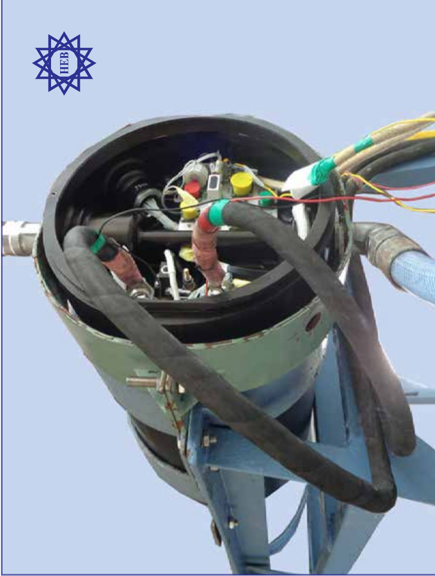
Sea Water Activated Battery for Naval applications