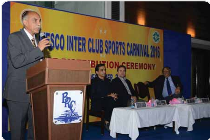
WESCO SPORTS CARNIVAL ORGANISED BY WEST COAST PAPER