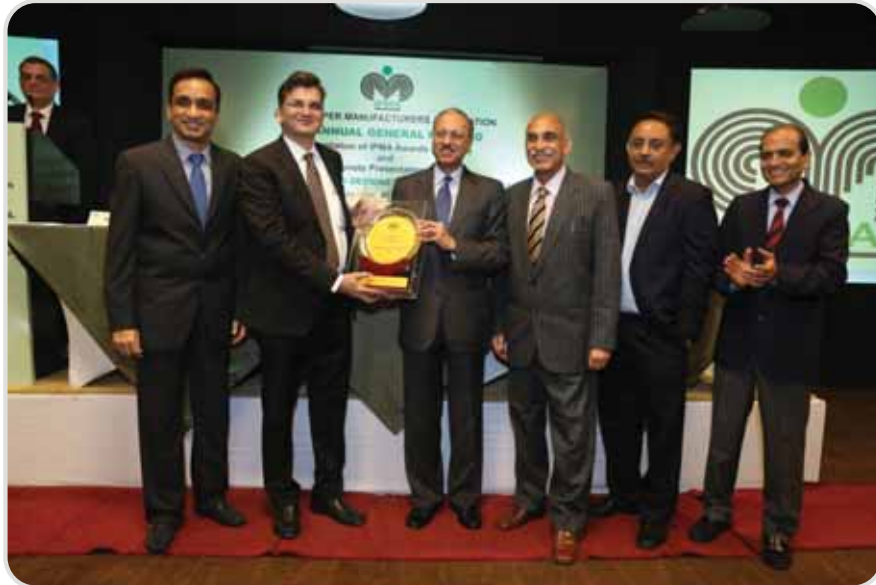
IPMA ENVIRONMENT AWARD 2015-16 AWARDED TO WEST COAST PAPER