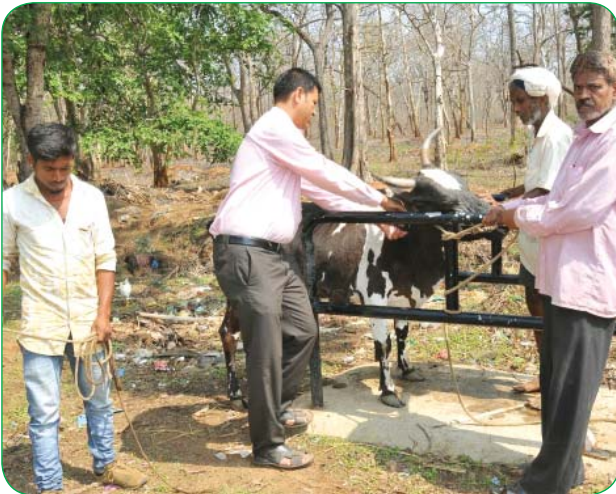
Animal Health Check-up camp