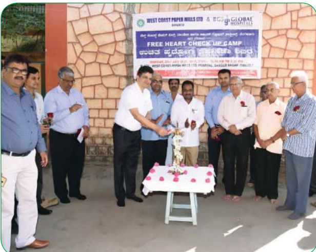
Health Check-up camp