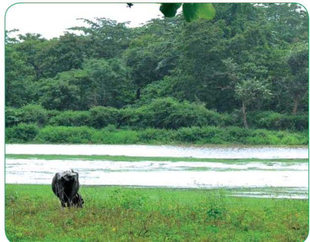
Lake Restoration and Rejuvenation