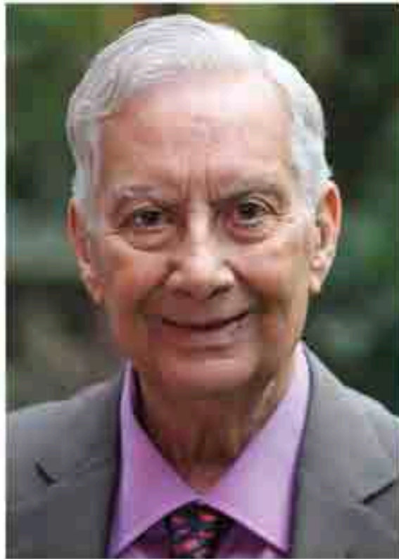
Mr. B.K. Birla - Chairman