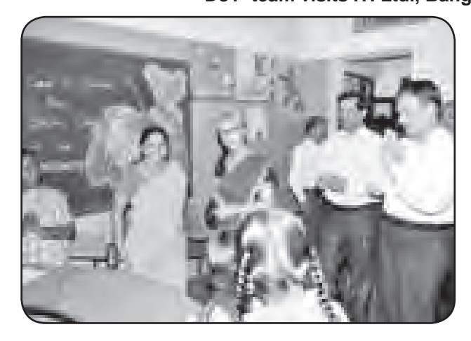
DoT team visits ITI Ltd., Bangalore on 3rd July 2013

APEX Meeting was held on 27th & 28th May 2013 at Bangalore Plant