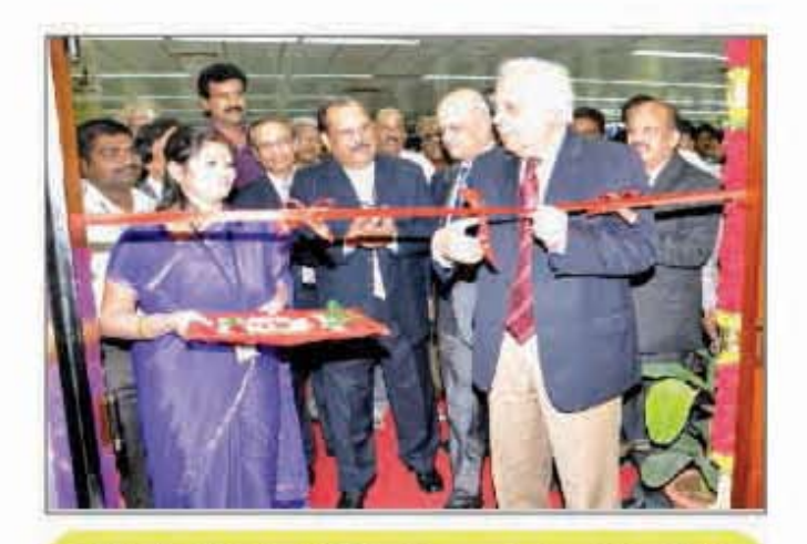
Mr. Kapil Sibal, Union Minister of Communications & IT and HRD, Inaugurated "New Products Lab" at Bangalore Plant on Feb. 5, 2012.