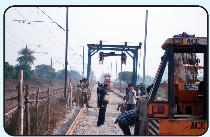
Laying of Sleeper in third line of Aligarh - Ghaziabad Section