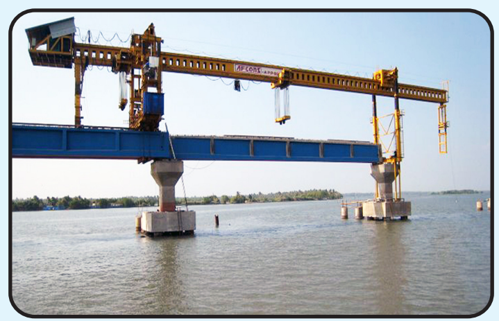
Launching of girders in Idapally - Vallarpadam Bridge on backwater in Kochin