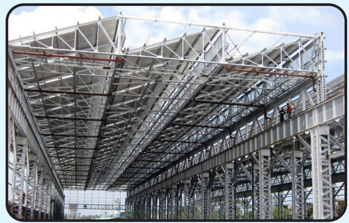
Construction of Dhankuni workshop shed (Front view)