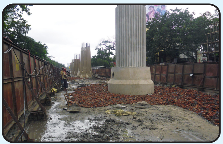
Isometric view of under construction piers in Jokha - Mominpur Section of Kolkata Metro