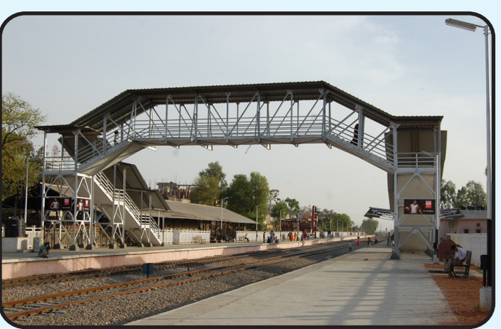
New FOB at Neem Ka Thana in Rewari - Fulera Section