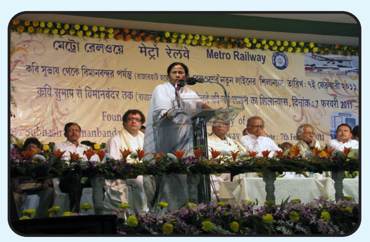
Honorable Ex Minister of Railway Ms. Mamta Banerjee Laying foundation stone of new Garia (Kavi-Subhas Nagar) to Viman Bander (Airport) - Section of Kolkata Metro