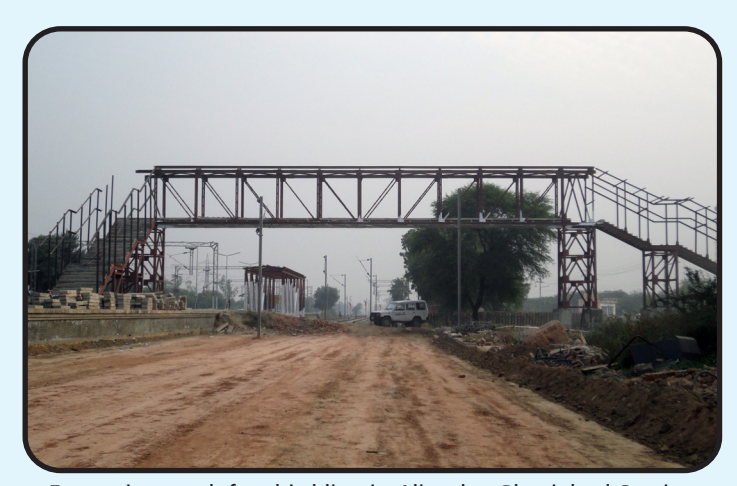
Formation work for third line in Aligarh - Ghaziabad Section