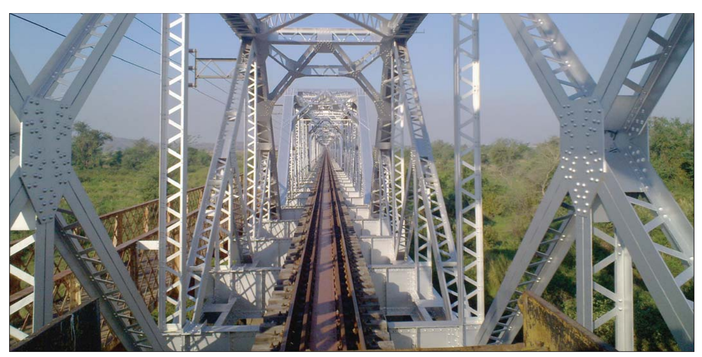
Rehabilitation of DONA ANA Bridge in Mozambique.