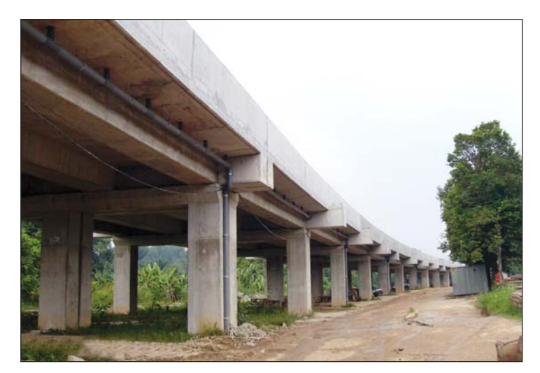
Viaduct - Malaysia Project

2. The Company was awarded a double tracking project (about 103 km length between Seremban and Gemas on design and build basis including all electrification, signaling and communication works) in Malaysia in December 2007 by Ministry of Railways, Government of Malaysia, at a value of ₹ 40840 million (about 1 billion USD). Physical works had started after detailed design in July 2008 as per schedule. Physical progress up to June 2010 is 47%. Though some initial delays took place due to non-availability of encumbrance free land at some locations, the work is likely to be completed by the target date of August 2012.