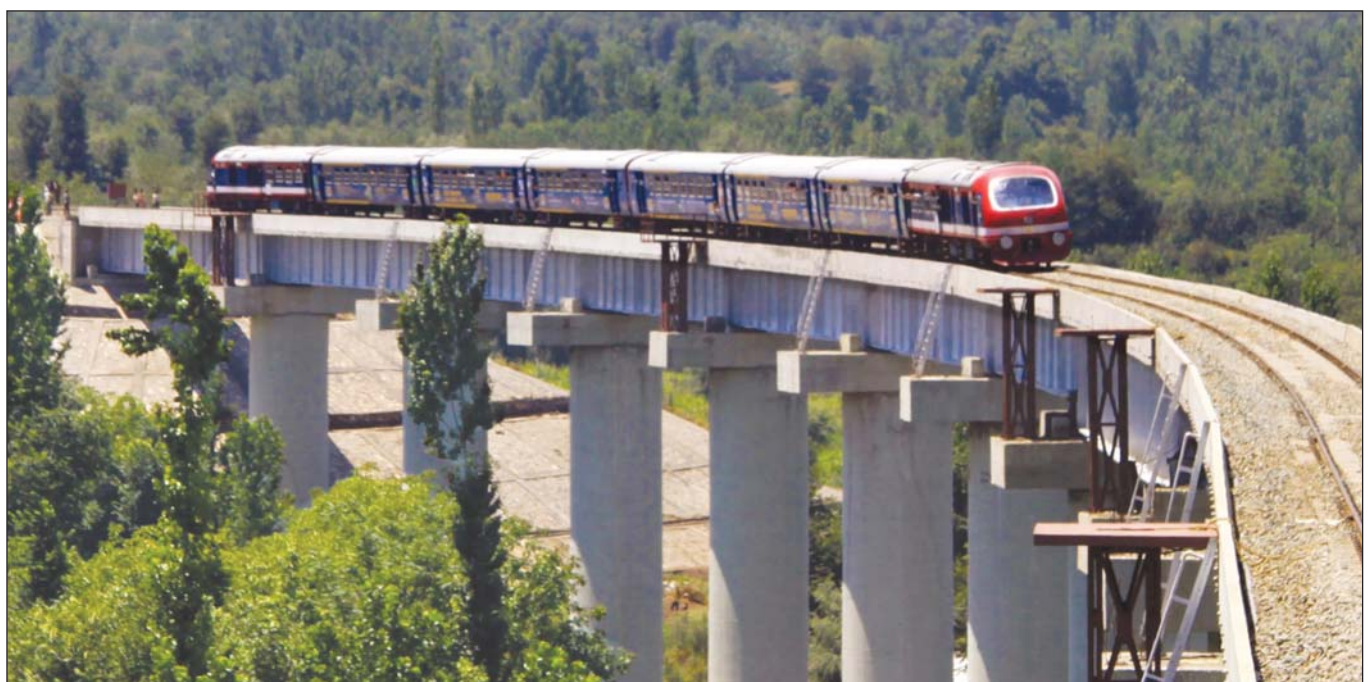
Diesel Multiple Unit on run J&K Project.