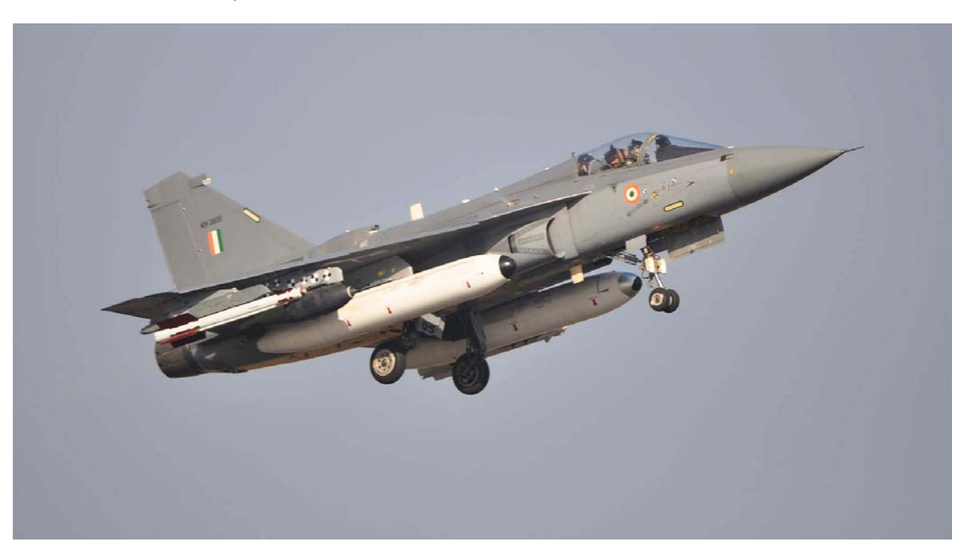
LCA with drop tanks during sea level trials

Over the years, the Company has registered around 2000 small and medium enterprises for participating in various