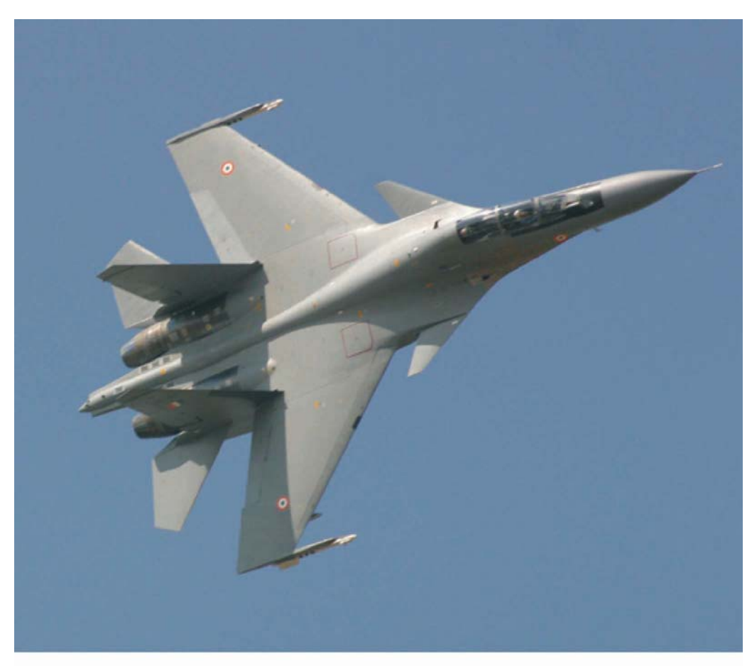
Su - 30MKI