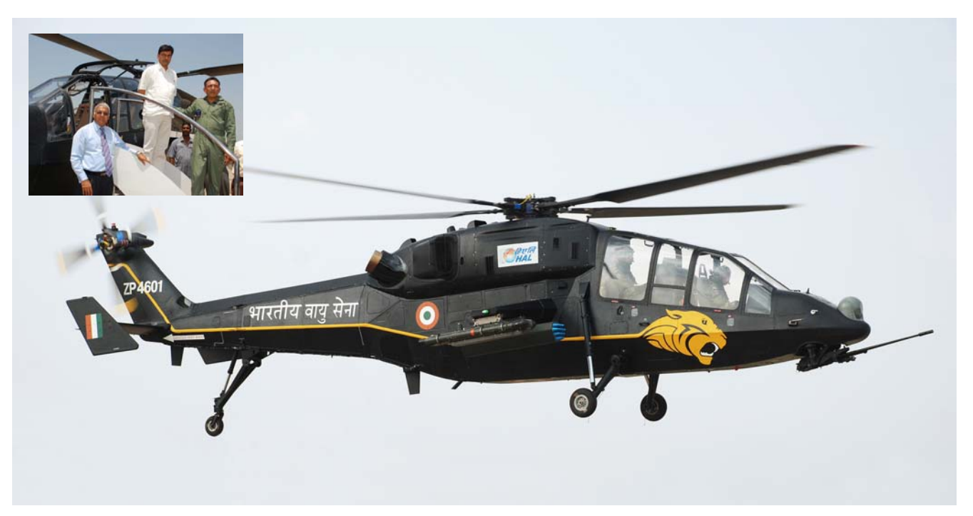
The Light Combat Helicopter (LCH) (Inset) Secretary (DP) Shri RK Singh during the maiden flight of LCH on 23<sup>rd</sup> May 2010

Your Company has geared up to enhance the capacity required to meet the commitments. The number of aircraft to be