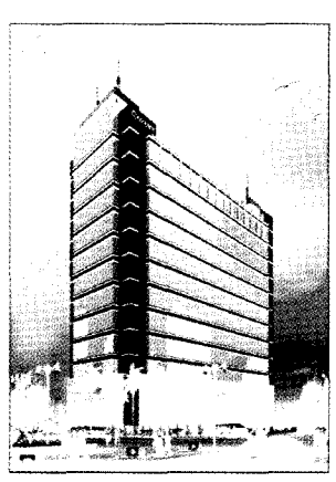
Eldeco Corporate Chamber - II