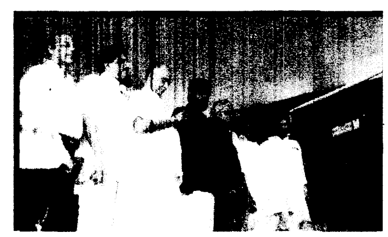
An auspicious moment: Hon'ble Union Minister Shri. Ram Vilas Paswan, Hon'ble Chief Minister of Kerala Shri. V.S. Achuthanandan and other Dignitaries after laying the foundation stone for FACT-RCF Building Products Ltd.