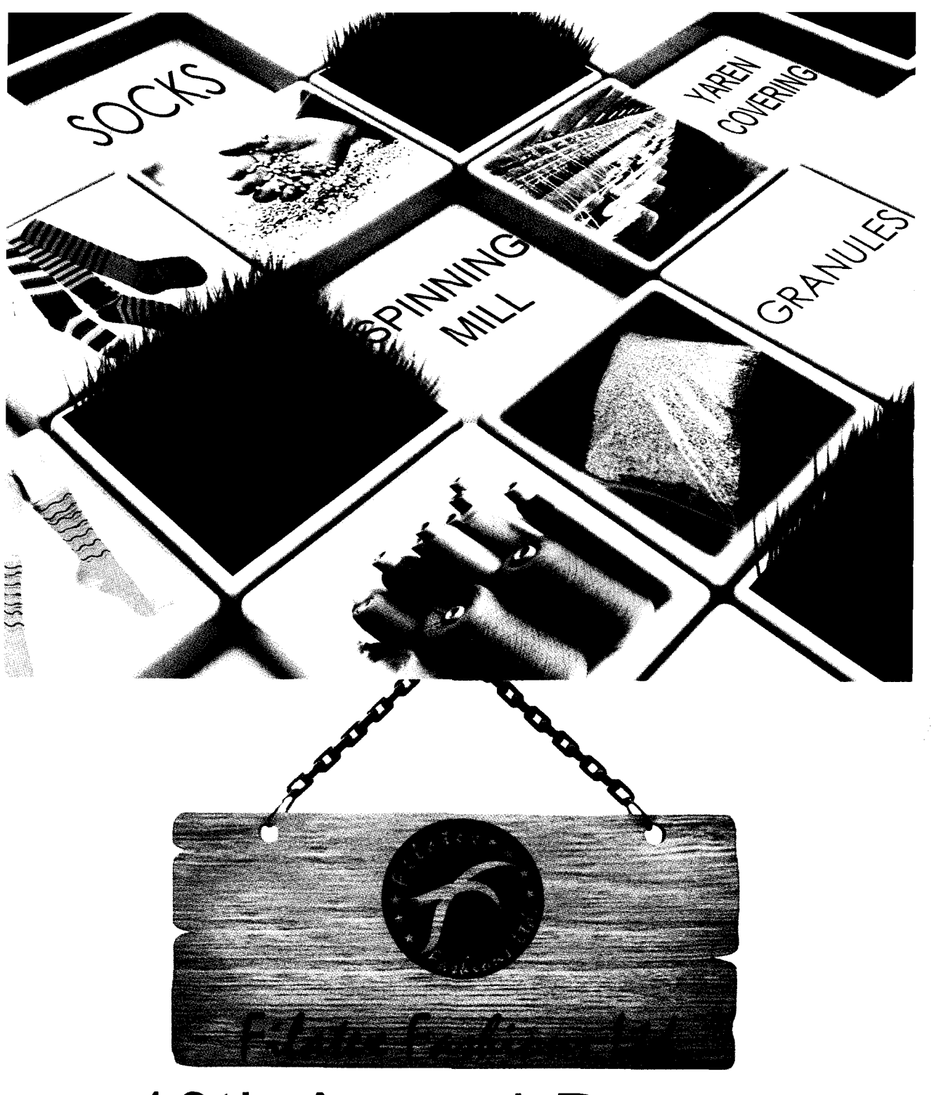
16th Annual Report