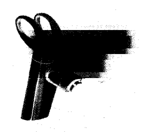
OS 17 Central hole basin mixer without popup waste