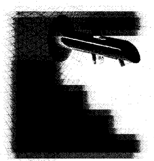
OS 14 Bath tub spout with button attachment for telephonic shower