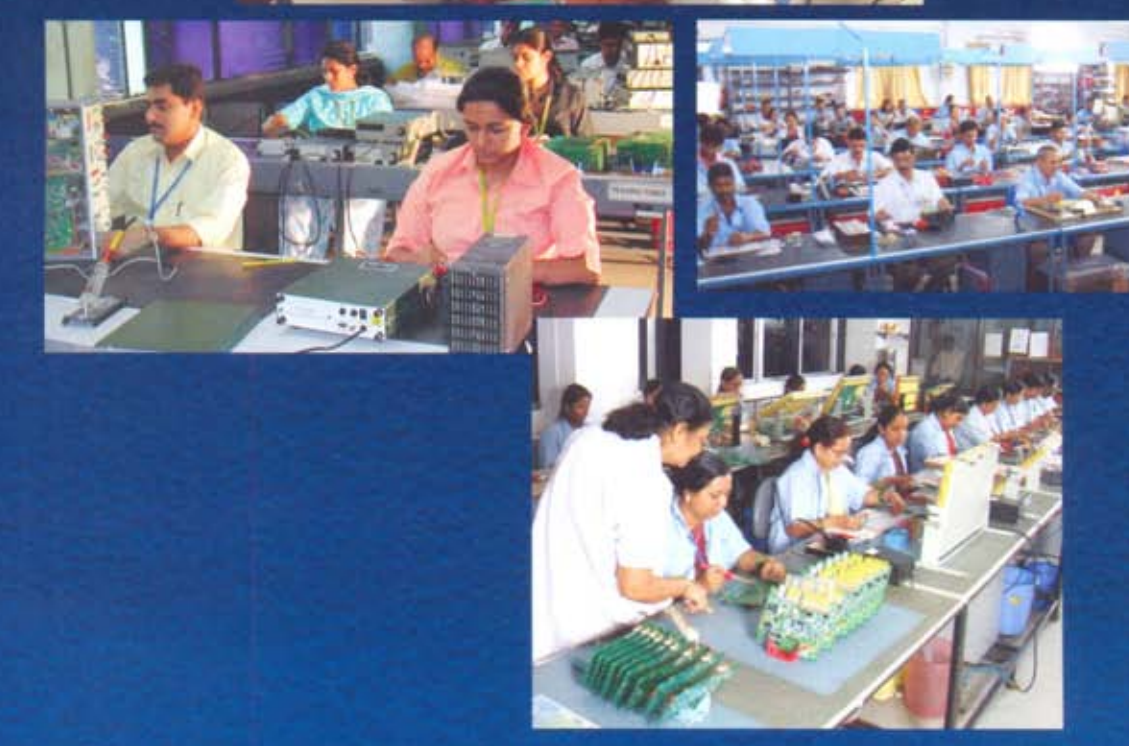
Glimpses of Your Company