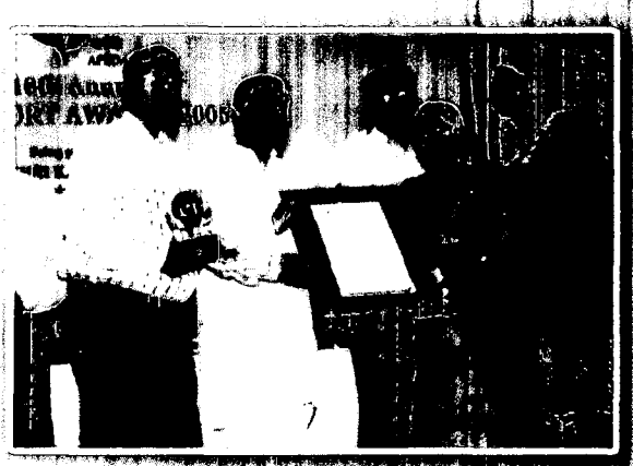
APEDA Export Award for outstanding contribution to export from India during the year 2005-06 by Hon'ble Shri Kanjal Nath, Union Minister of Commerce & Industry on 30th April, 2007 at New Delhi.