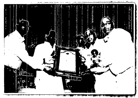
APEDA Export Award for outstanding contribution to export from India during the year 2006-07 by Hon'ble Shri Kamal Nath, Union Minister of Commerce & Industry on 30th May, 2008 at New Delhi.