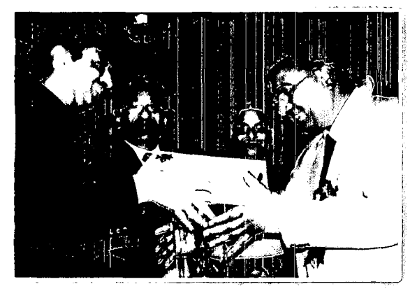
Best Export Oriented Unit (Non SSI Category - Food product sector) award by Hon'ble Shri Kamal Nath, Union Minister of Commerce & Industry on 19th January, 2007 at New Delhi for the year 2004-05.