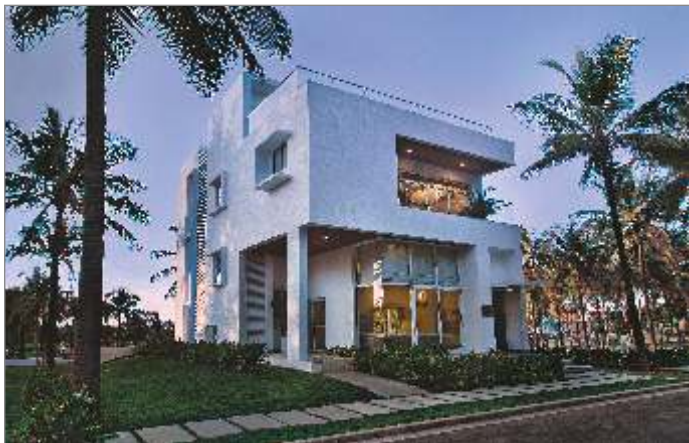
Godrej Gold County, Bengaluru – 0.05 mn sq. ft.