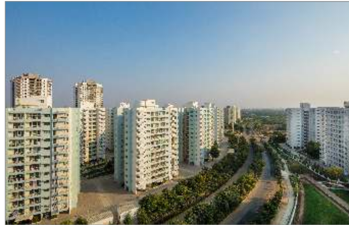
Godrej Garden City, Ahmedabad – 0.61 mn sq. ft.