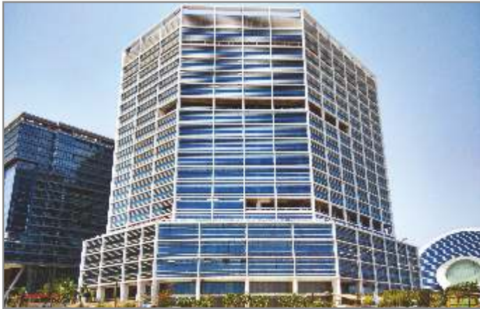
Godrej BKC, Mumbai – 1.28 mn sq. ft.

Delivered 1.94 million sq. ft. across three cities in Q1 FY17