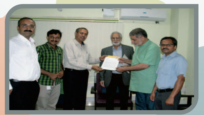
Kennametal sponsored the post-training internship costs of Rs. 6,00,000/- for 20 disabled candidates as part of its support to Enable India, an organization which empowers people with disabilities.