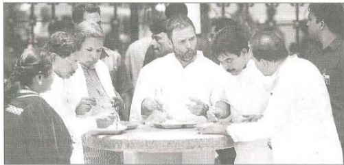
Congress vice-president Rahul Gandhi and Karnataka CM Siddaramaiah eat at the newly launched 'Indira Center' in Bengaluru Wednesday. Rahul launched the state government's subsidised canteens that would give breakfast at Rs 5 and lunch, dinner at Rs 10.