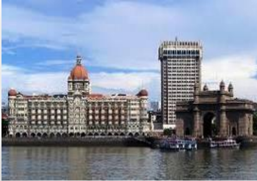
Taj Mahal Palace, Mumbai 543 Rooms