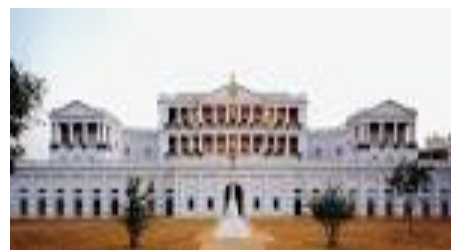
Taj Falaknuma Palace, Hyderabad 60 Rooms