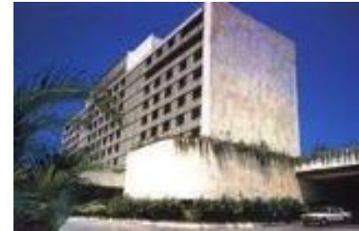
Taj Coromandel, Chennai 212 Rooms