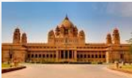
Umaid Bhavan Palace, Jodhpur 64 Rooms