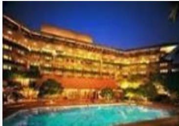
Taj Bengal, Kolkata 229 Rooms