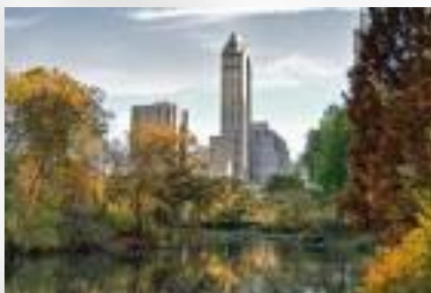
The Pierre, New York 189 Rooms