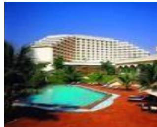
Taj Krishna, Hyderabad 260 Rooms