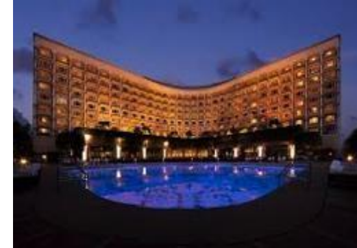
Taj Palace, New Delhi 403 Rooms