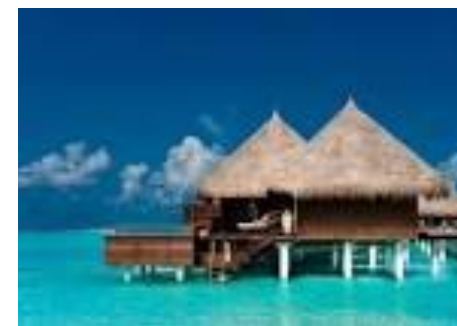
Taj Exotica Resort and Spa, Maldives, 64 Rooms