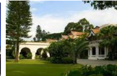
Taj West End, Bangalore 117 Rooms