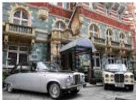
St. James Court, London 338 Rooms