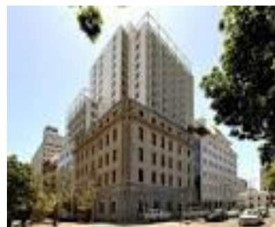
Taj Cape Town, 166 Rooms