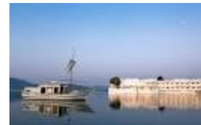
Taj Lake Palace, Udaipur 83 Rooms