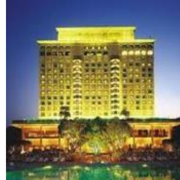
Taj Mahal Hotel, New Delhi 292 Rooms