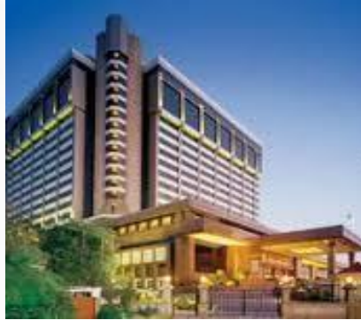
Taj Lands End, Mumbai 493 Rooms