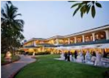
Taj Exotica , Goa 136 Rooms