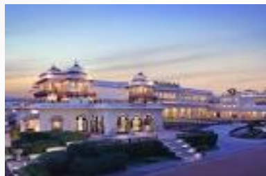
Rambagh Palace, Jaipur 78 Rooms