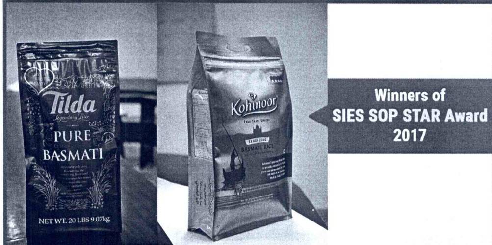
Winners of SIES SOP STAR Award 2017