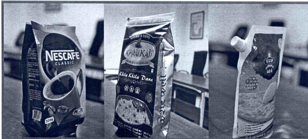
Winners of INDIASTAR Award 2017 and SIES SOP STAR Award 2017