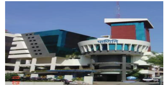
Senapati Bapat Road, Pune