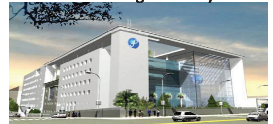
MIDC, Parsodi, Nagpur