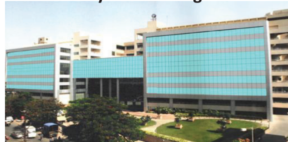
Karve Road, Pune