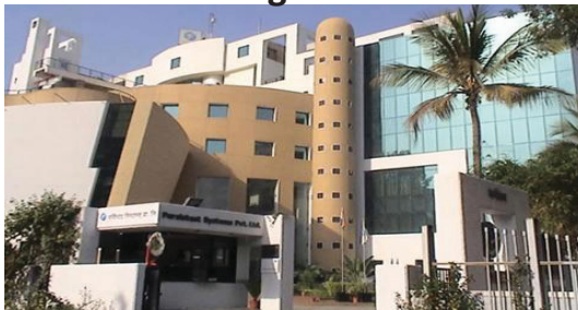
Senapati Bapat Road, Pune