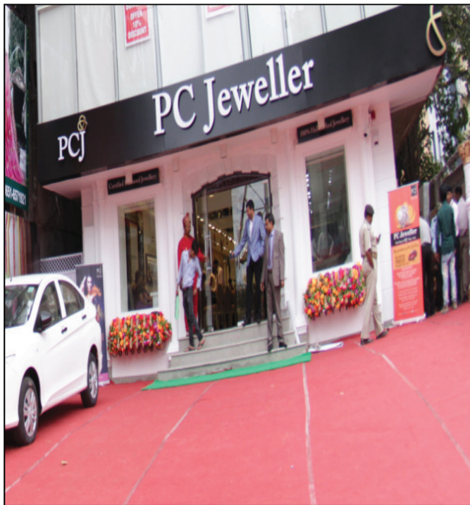
Ranchi, Jharkhand (May 2014) (3,300 sq. ft.)