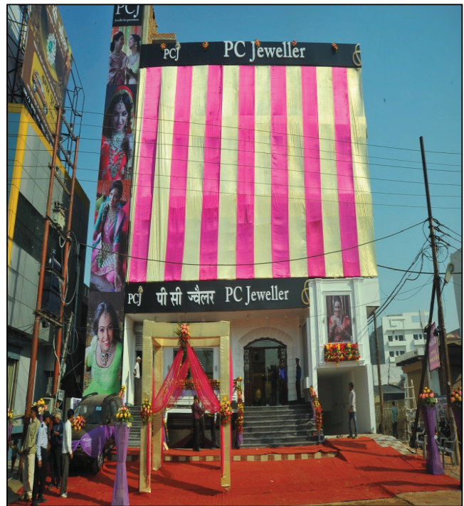
Mathura, UP (Oct 2014) (3,200 sq. ft.)