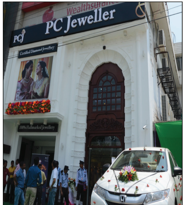
Guwahati, Assam (June 2014) (4,350 sq. ft.)