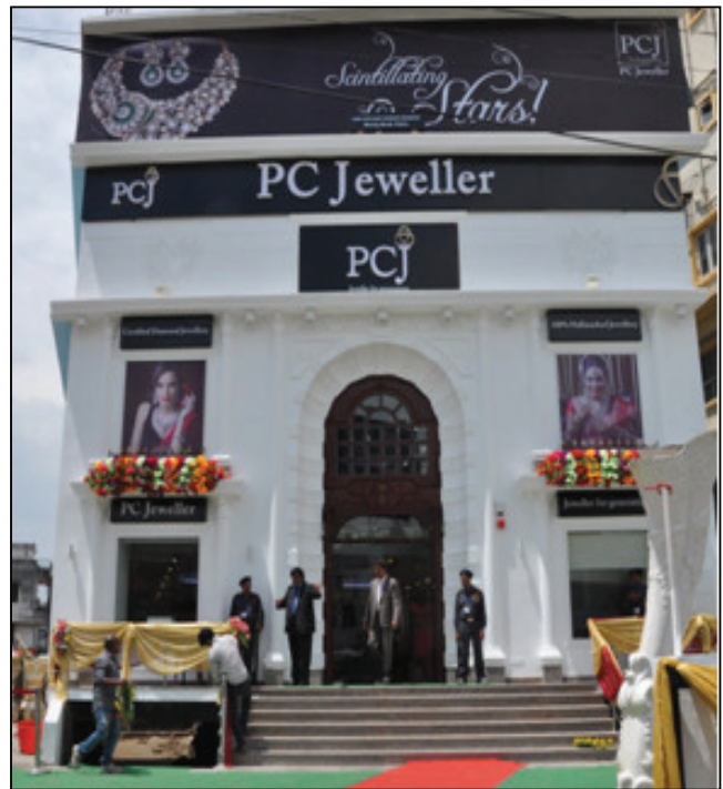
Patna, Bihar (July 2014) (6,378 sq. ft.)