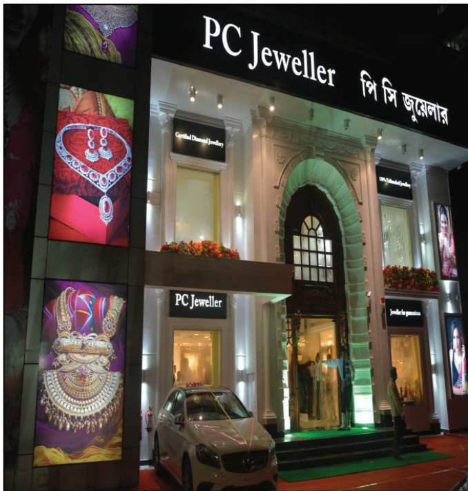
Kolkata, West Bengal (Sep 2014) (8,198 sq. ft.)