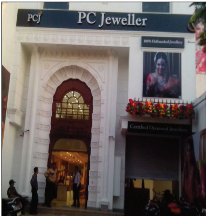
Jammu, J&K (June 2014) (3,250 sq. ft.)