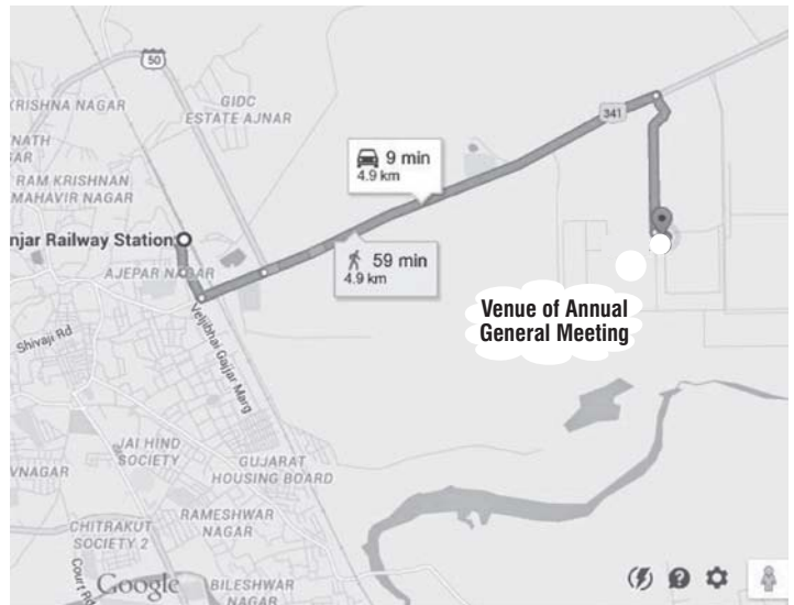
Route Map - Anjar Station to Welspun