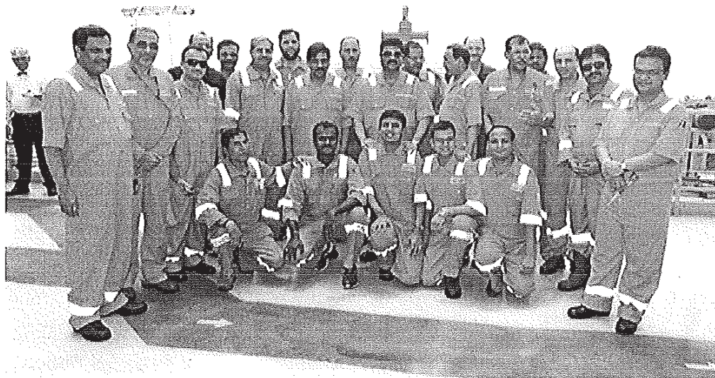
Sh. Dharmendra Pradhan Minister of State (I/C) MoPNG with ONGC officers and staff at rig Virtue 1 in Mumbai offshore

Shri Pradhan also interacted with ONGCians on the platforms and rigs, especially the young officers, and appreciated their commitment and work for the energy security of India.