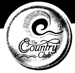
Why go anywhere else