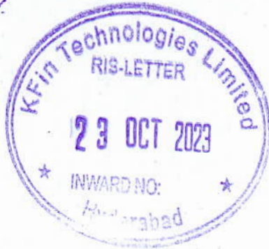
ABB 5103 TR02