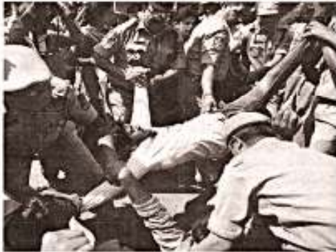
విద్యార్థులను తిట్టిన రాష్ట్ర పోలీసులు

అరెస్టు - గురుకుల పోస్టులో మార్కుల నిబంధన