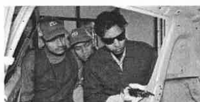
Students at Maruti Suzuki tie-up ITIs get hands-on training on the latest automobile technologies and best practices in service industry