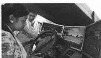
Driving training – a scientifically designed curriculum with a combination of classroom and practical sessions.