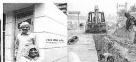
Maruti Suzuki's holistic approach for sustainable development of local communities is touching thousands of lives.

CSR has always been an integral part of Maruti Suzuki's business approach and strategy.